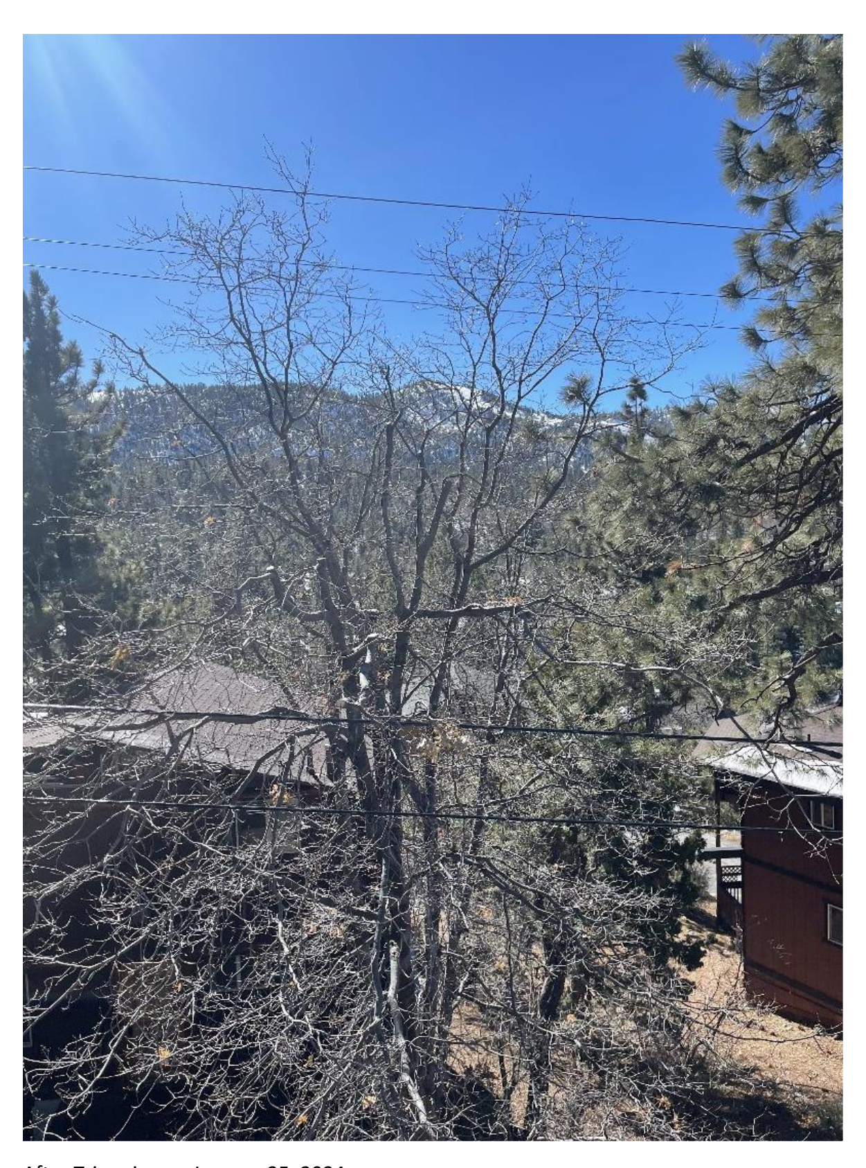
After Trimming on January 25, 2024