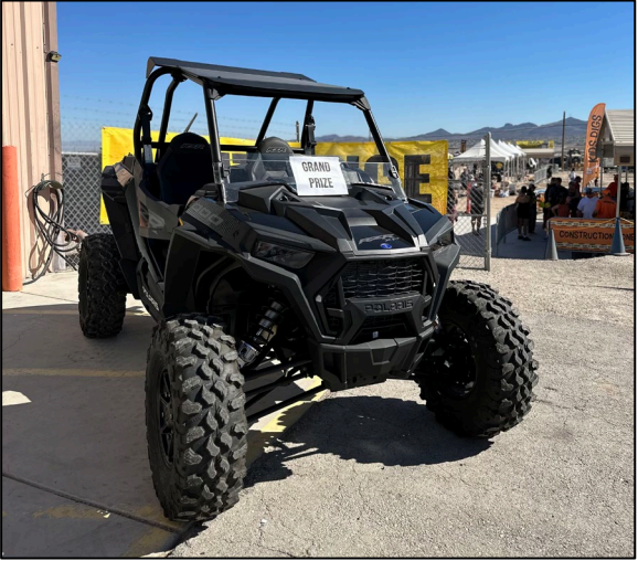
Backhoe Equipment Operators competed in different challenges for a Polaris RZR.