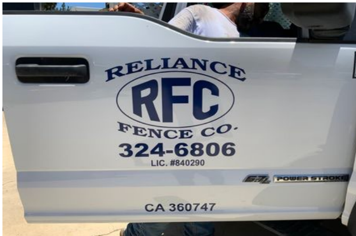
Photo 1 provided by Southern California Gas Company depicts excavator’s truck.