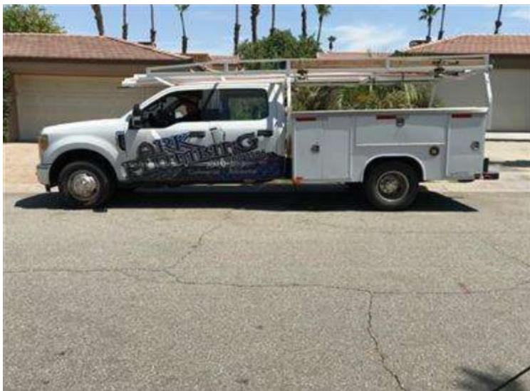
Photo 1, provided by Southern California Gas Company, depicts ARK Plumbing’s truck at the location where the damage occurred.