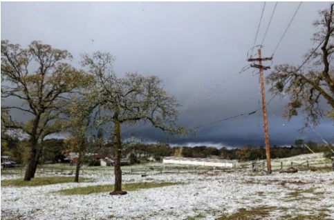
Shown: Oak Trees in Snow Near Lines

Shrubs under utility lines can act as ember catchers and prevent the invasion of flammable grasses.