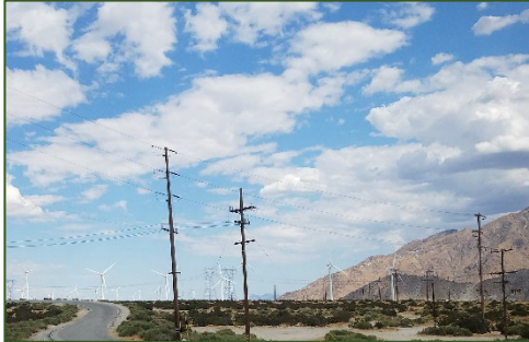
Shown: Shrubs Under Utility Lines, Palm Springs

Shrubs under utility lines can act as ember catchers and prevent the invasion of flammable grasses.