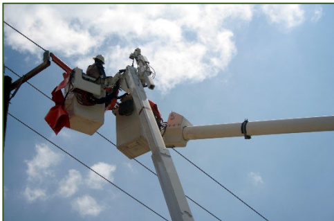
Shown: Utility Workers Using Bucket Trucks

The WSAB recommends assessment of vegetation beyond the immediate area beneath and closely around power lines.