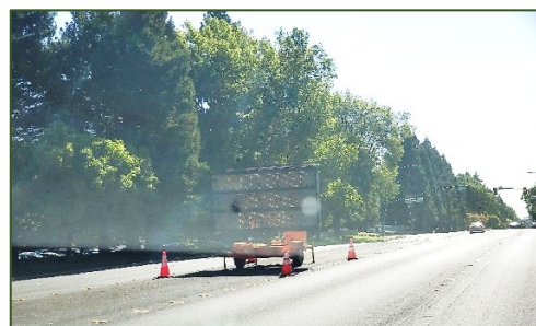
Shown: PG&E Signs Directing Traffic

New technologies and protocols can pose safety concerns for implementing workers