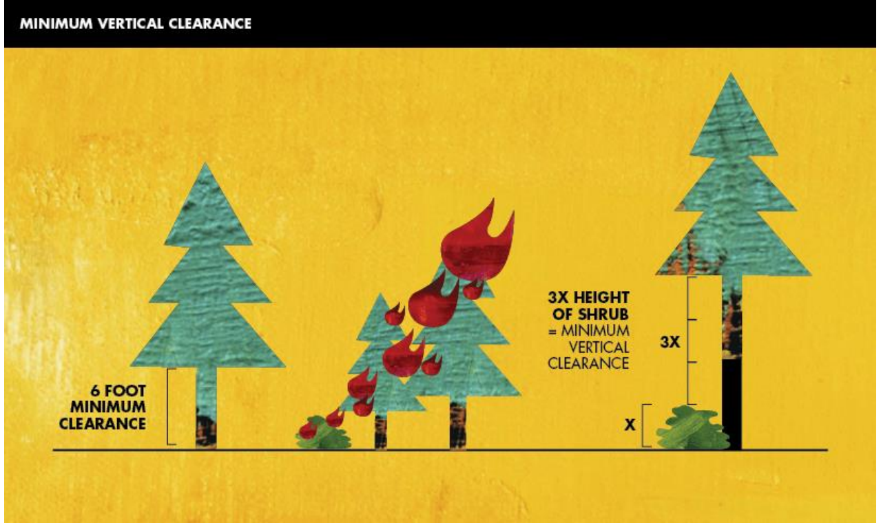
Figure 3. A Five Foot Shrub is Growing Near a Tree. 3x5=15 feet of clearance needed between the top the shrub and the lowest tree branch