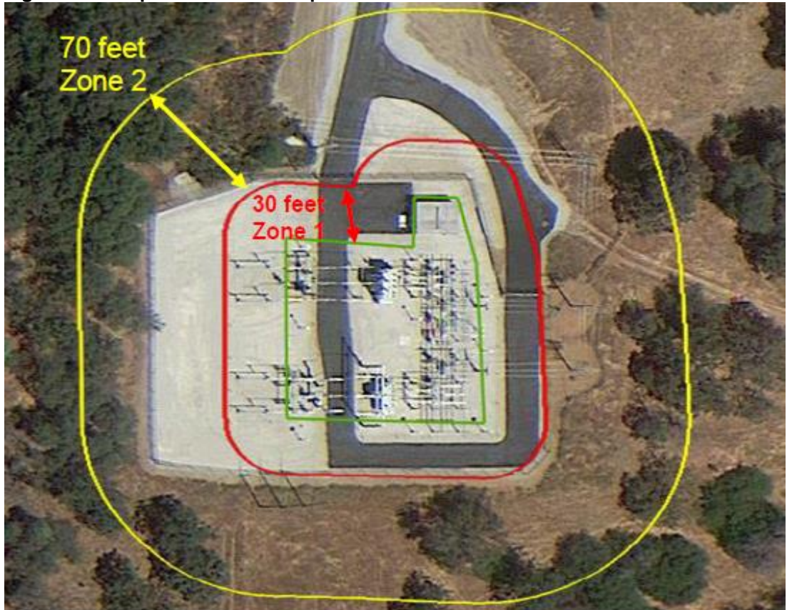
Figure 1. Example of Defensible Space Zones