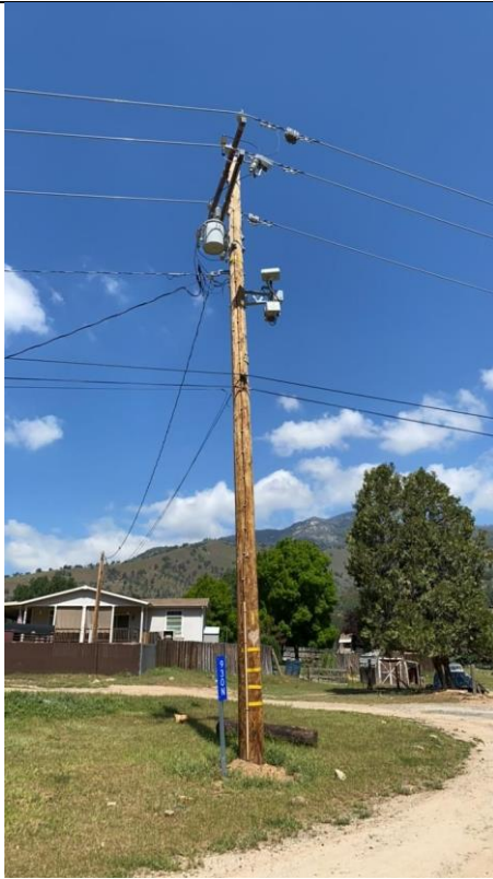
Item5GImg1: Overall pole