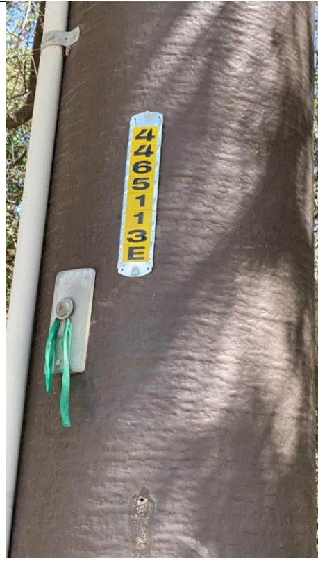
Item2GImg2: Pole ID