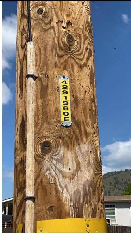
Item5GImg2: Pole ID