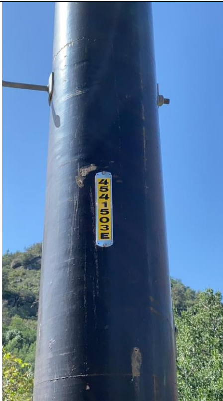
Item1Gimg2: Pole ID