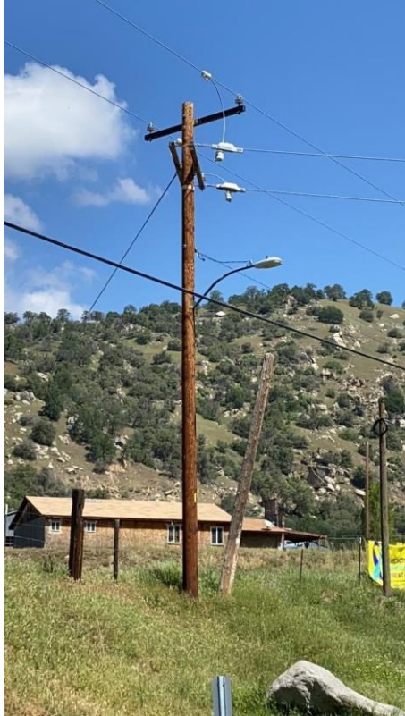
Item4Gimg1: Overall pole