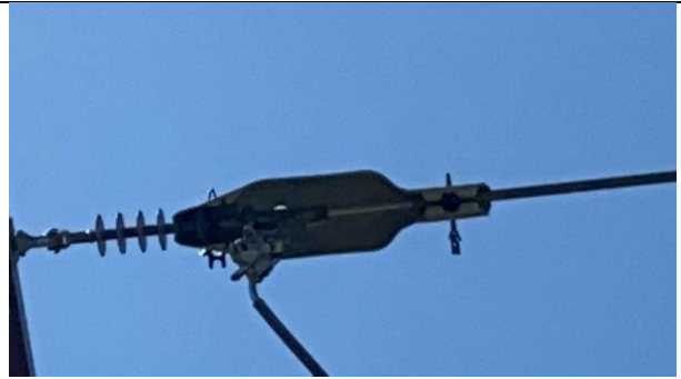
Item6IA2Img2: Close up of exposed conductor