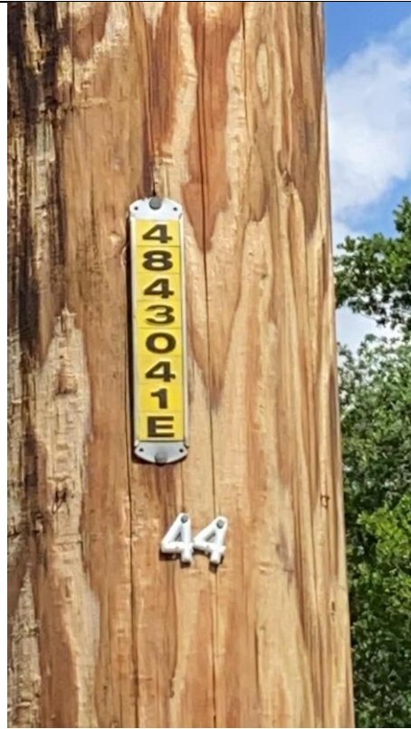
Item10GImg2: Pole ID