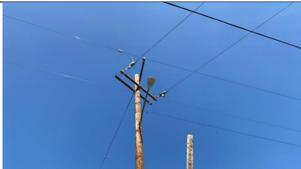
Item4IA1img1: No vibration dampers