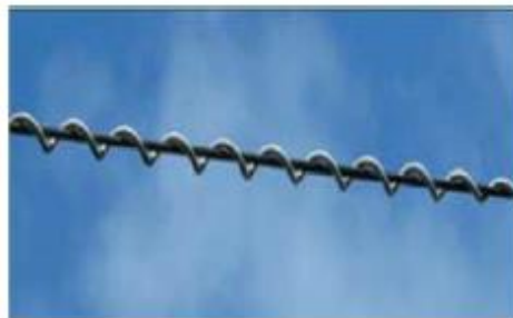
Figure 2: Spiral Damper