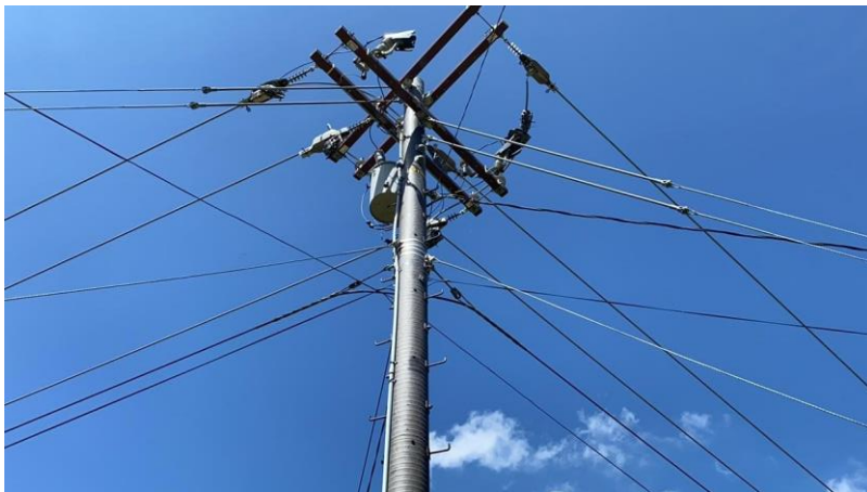
Item6IA1Img1: No vibration dampers