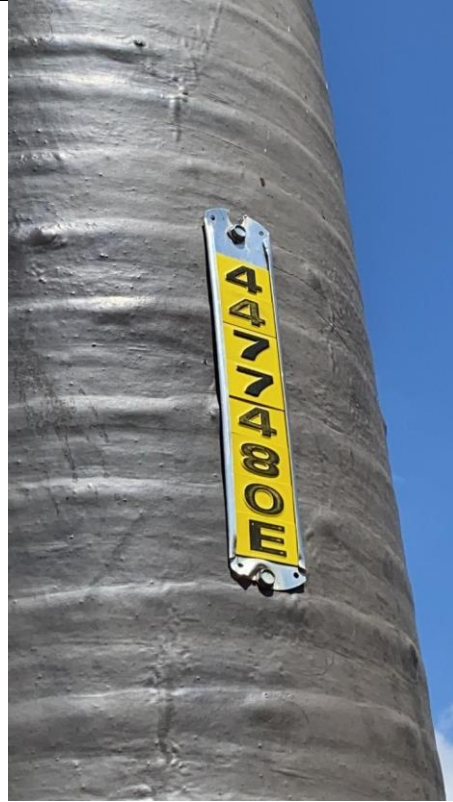
Item6GImg2: Pole ID