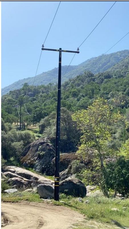
Item1Gimg1: Overall Pole