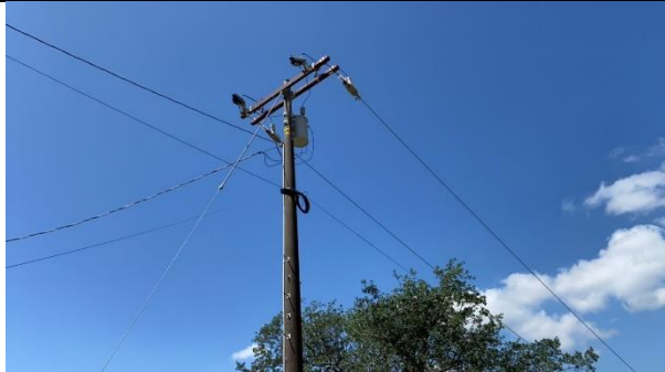
Item3IA1Img1: No vibration dampers