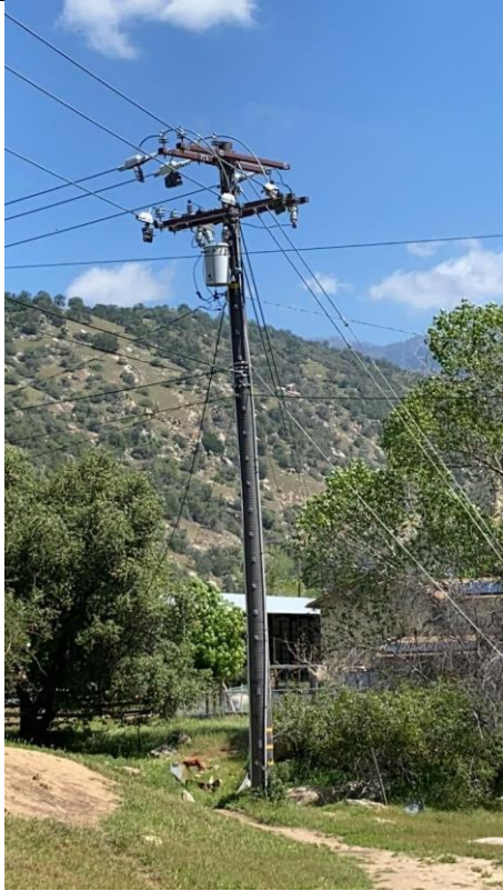
Item6GImg1: Overall pole