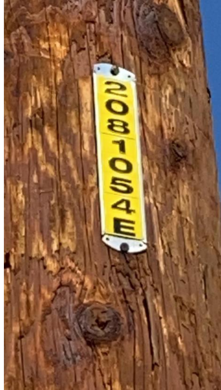
Item4Gimg2: Pole ID