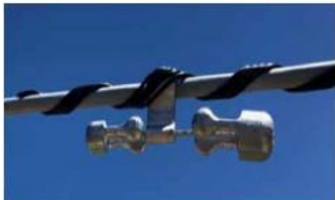
Figure 1: Stockbridge Damper

Installing vibration dampers on the covered conductor mitigates Aeolian vibration by protecting the covered conductor from abrasion and fatigue damage. The vibration damper standard was put into effect in October 2020 and is required for all covered conductors in light loading areas (elevation below 3,000 feet). Recently, SCE has been experiencing an acute shortage of Stockbridge Dampers (refer to Figure 1) for 336 ACSR Covered Conductor due to the high demand and supplier constraints. Additionally, the spiral vibration dampers (refer to Figure 2) for 1/0 ACSR, #2 Copper, and 2/0 Copper may be running low on stock.