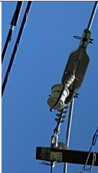
Item10IA1img2: Connector cover split open