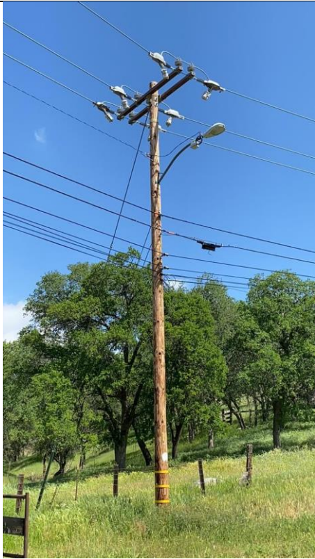
Item10GImg1: Overall pole