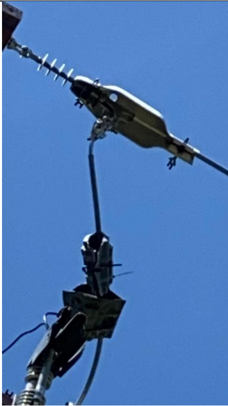
Item6IA2Img1: Bolted wedge connector cover not installed or fell off