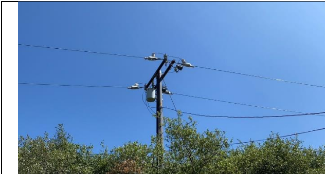
Item2IA1Img1: No vibration dampers on span