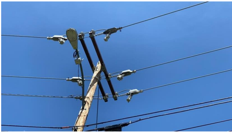
Item10IA2Img1: No vibration dampers