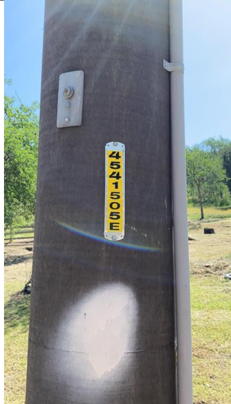
Item3GImg2: Pole ID