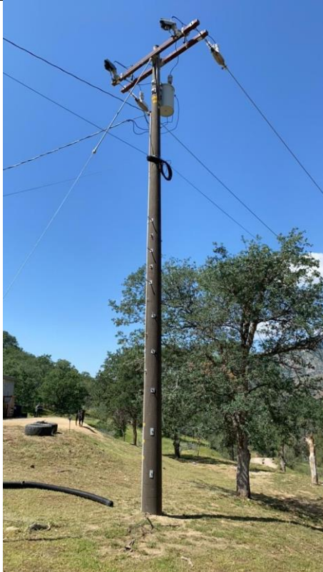
Item3GImg1: Overall pole