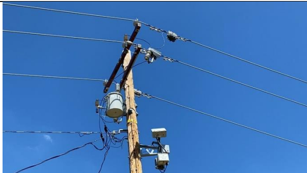
Item5IA1img1: No vibration dampers