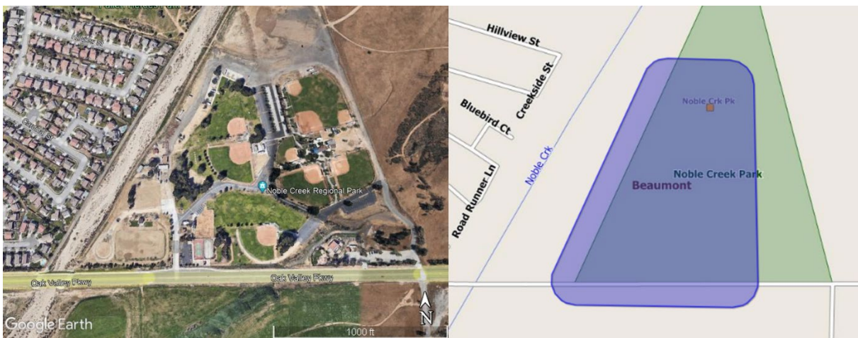
Figure 1: Map images of Noble Creek Park. The satellite view on the left obtained from Google Earth. The map view on the right, identified in a ticket search of B220050037 on DigAlert’s website, shows the excavation area over the park area.