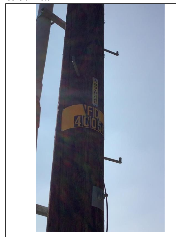
Item3Glmg1: Pole 4831822E