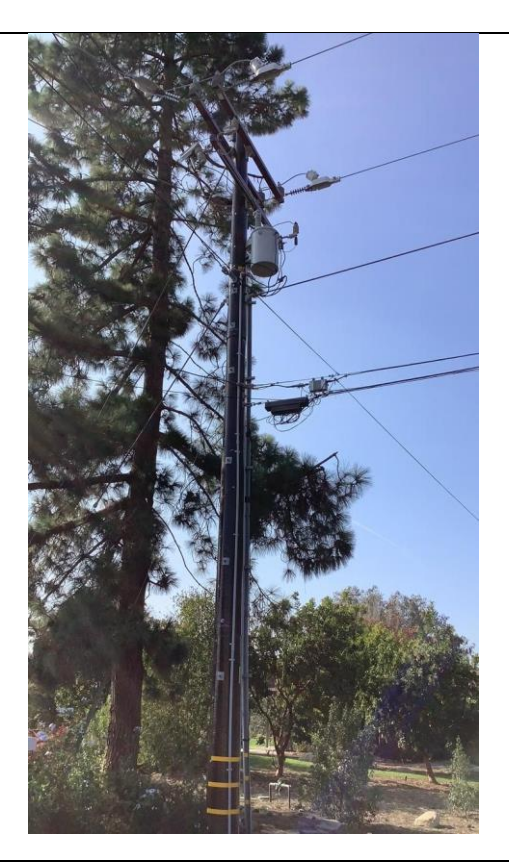
Item2GImg2 : Overall view of the pole and covered conductor installation.