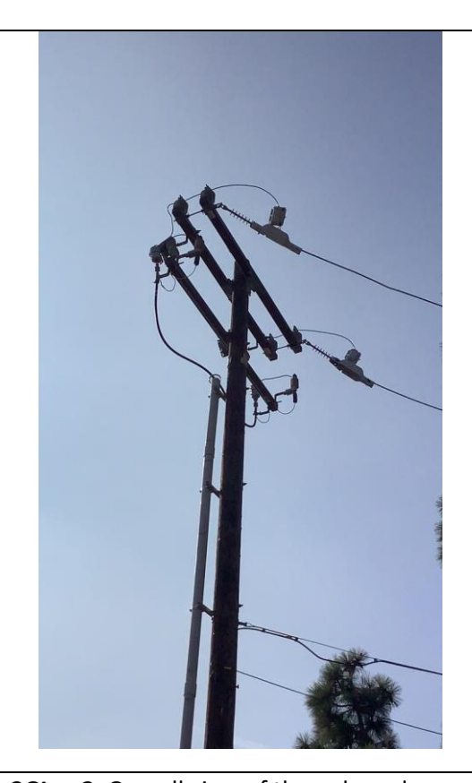
Item3GImg2 : Overall view of the pole and covered conductor installed