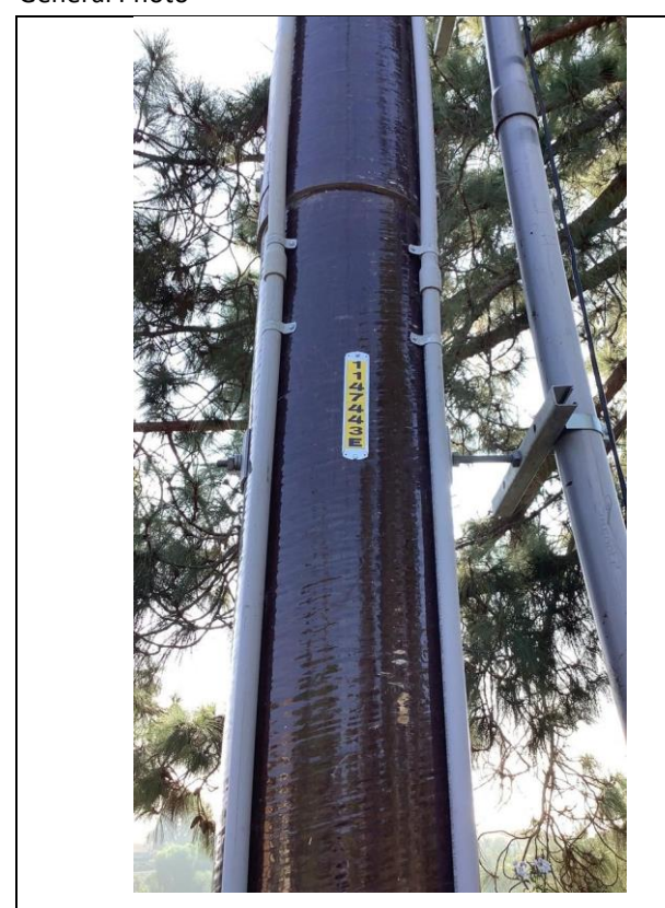
Item2GImg1: Pole 1147443E