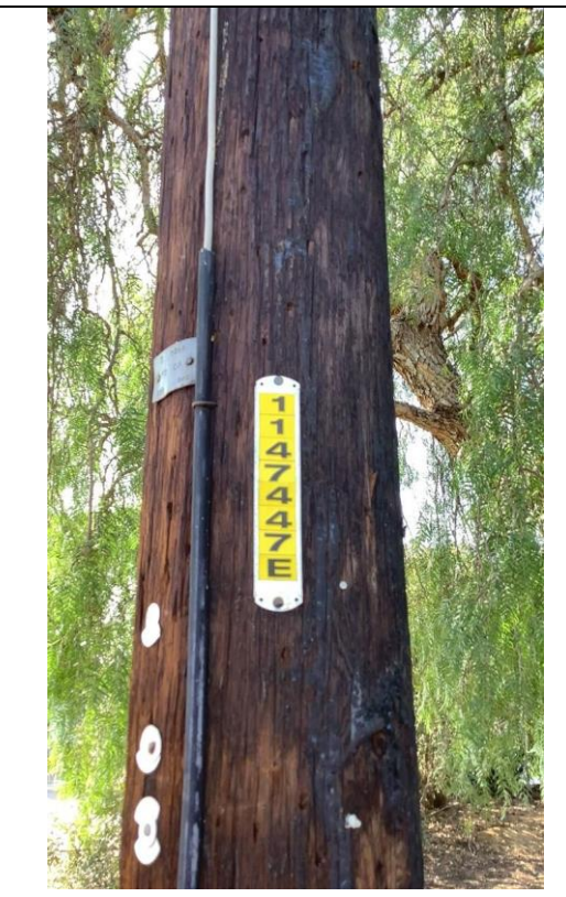
Item1GImg1: Pole 1147447E