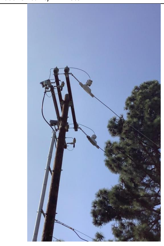
Item3IA1Img1: No vibration dampers are installed