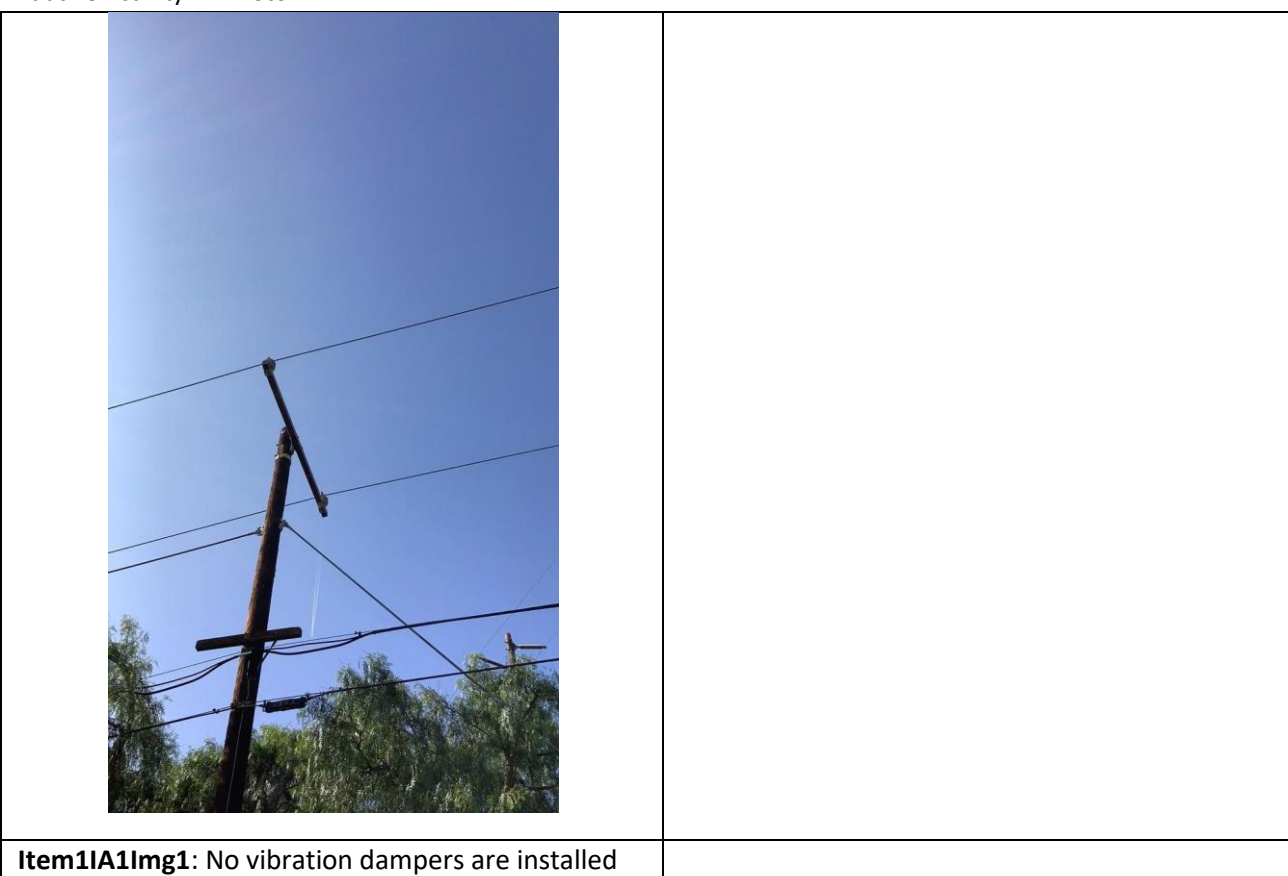
Initiative Activity #1 Photo