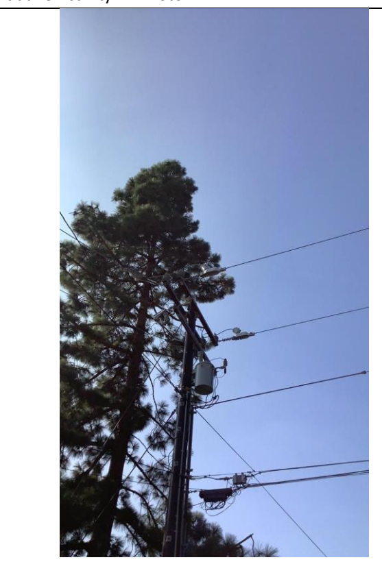
Item2IA1Img1: No vibration dampers are installed