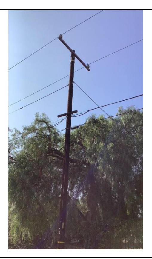
Item1GImg2 : Overall view of the pole and covered conductor installation