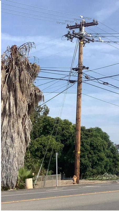
Item6GImg1: Overall pole