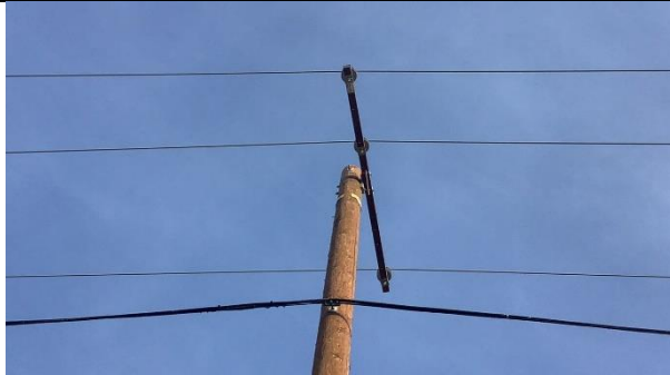
Item10IA1Img1: No vibration dampers installed