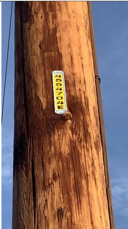
Item9Gimg2: Pole ID