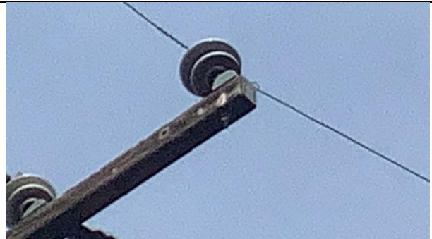
Item2IA1Img2: Bare wire closeup