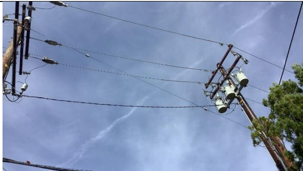
Item7IA1Img1: Porcelain guy insulator