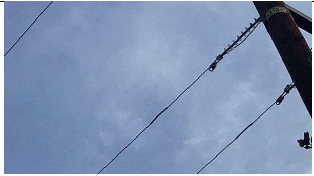
Item1IA1Img2: Close up of bare wire