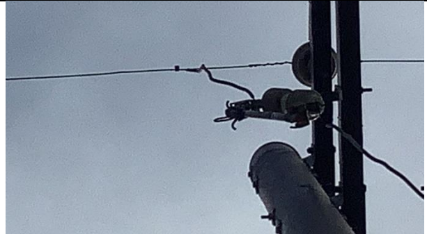
Item3IA1Img2: Close up of bare wire