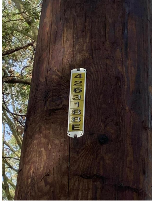
Item5Gimg2: Pole ID