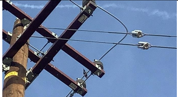
Item11IA1Img2: Close up of porcelain insulator