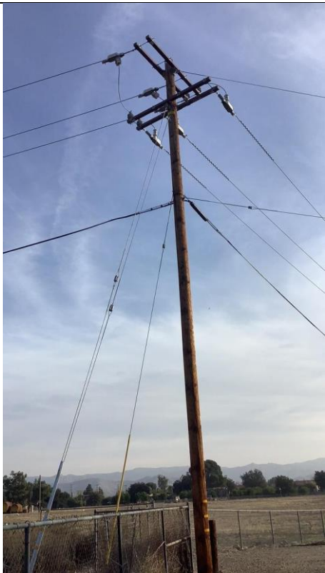
Item9Gimg1: Overall pole