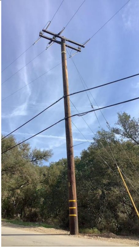
Item4GImg1: Overall pole