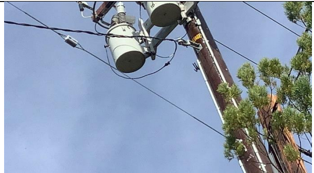
Item7IA1Img2: Porcelain insulator close up