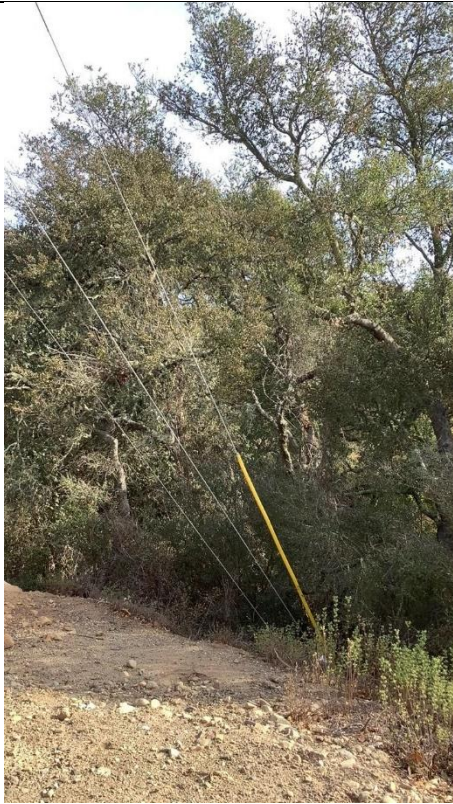
Item4GW1Img1: Loose guy wire