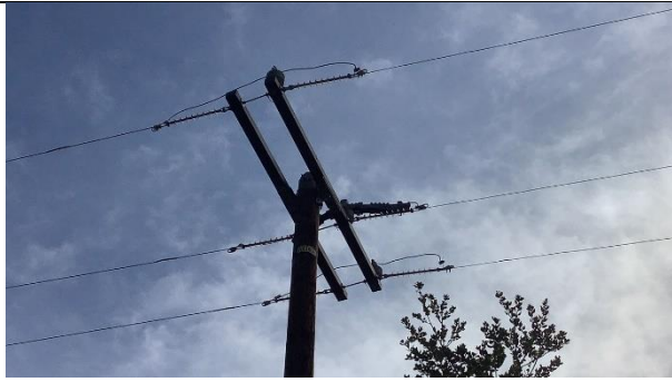
Item1IA1Img1: No covered conductor