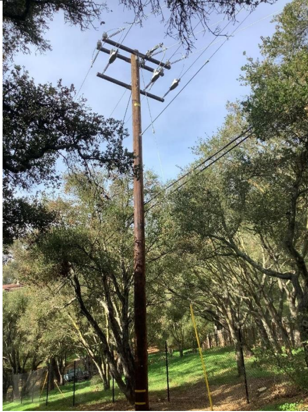
Item5Gimg1: Overall pole