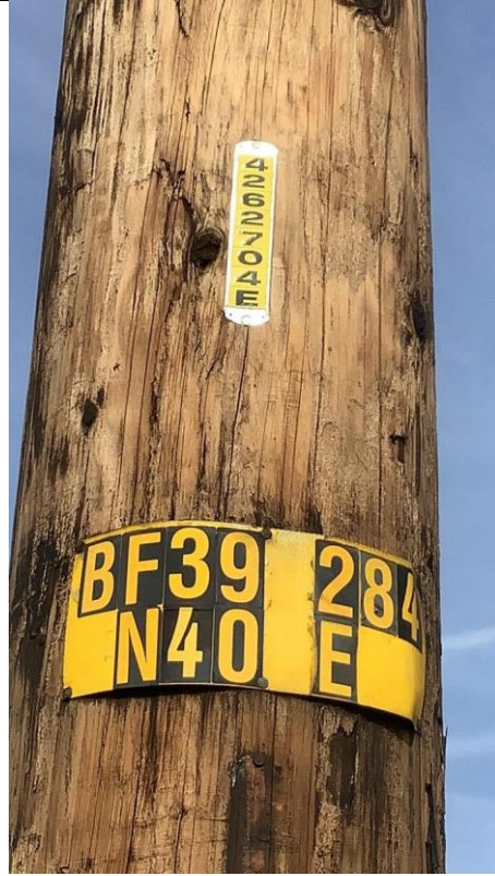
Item6GImg2: Pole ID