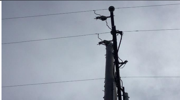
Item3IA1Img1: Bare wire