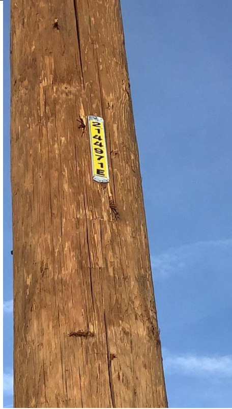
Item10GImg2: Pole ID