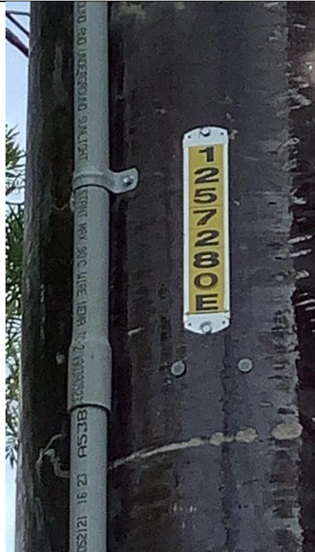
Item7GImg2: Pole ID