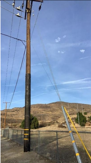
Item11IA1Img1: Overall view of down guy