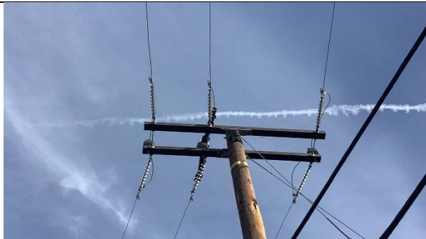
Item4IA1Img1: Bare wire