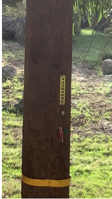
Item1Gimg1: Overall Pole