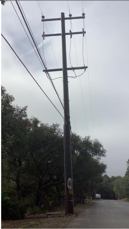
Item3GImg1: Overall pole