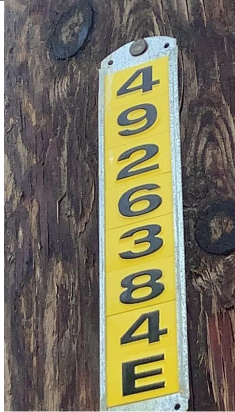
Item4GImg2: Pole ID