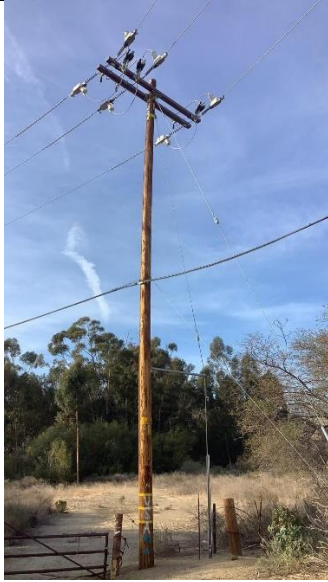
Item8GImg1: Overall pole