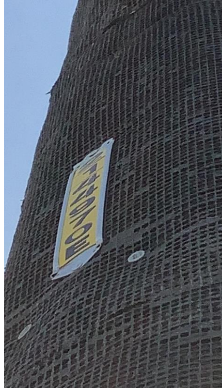
Item11GImg2: Pole ID