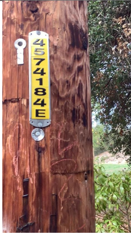
Item2GImg2: Pole ID