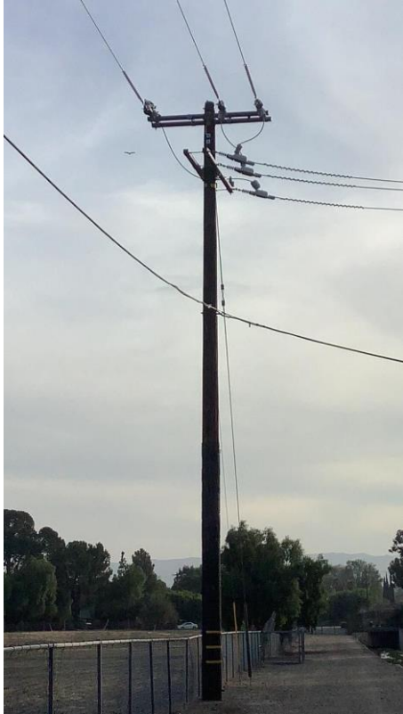
Item11GImg1: Overall pole