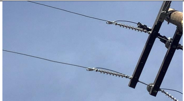
Item4IA1Img2: Close up of bare wire