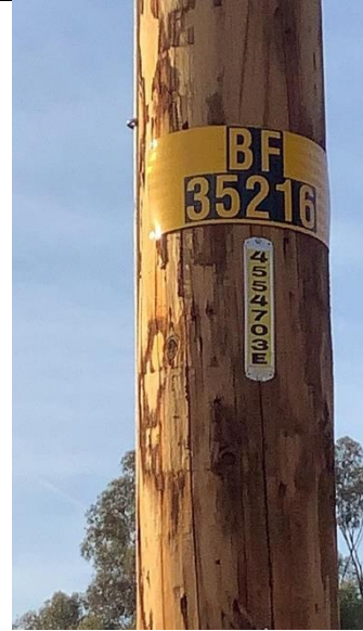
Item8GImg2: Pole ID