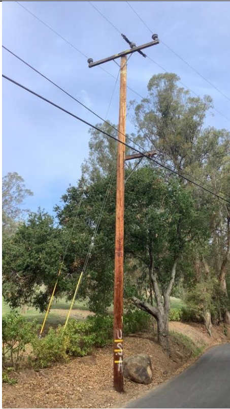
Item2GImg1: Overall Pole