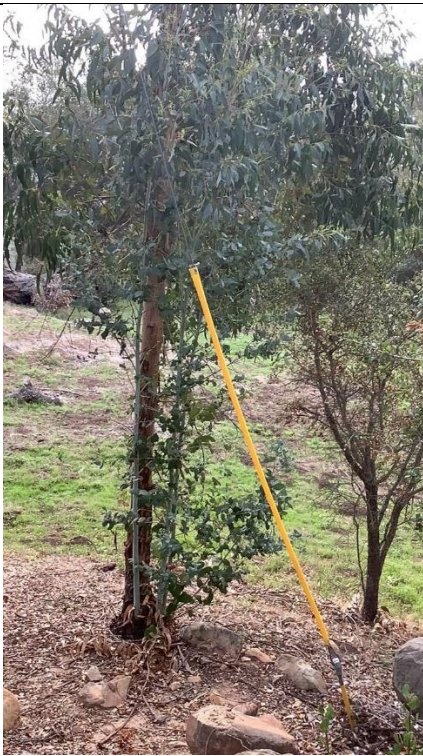
Item1GW1Img1: Loose guy wire