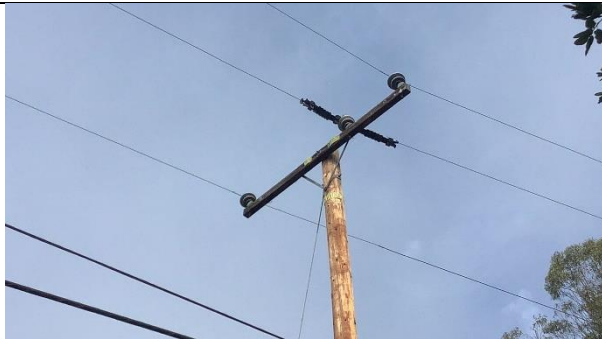
Item2IA1Img1: Bare wire