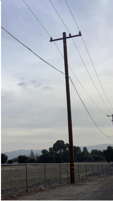
Item10GImg1: Overall pole