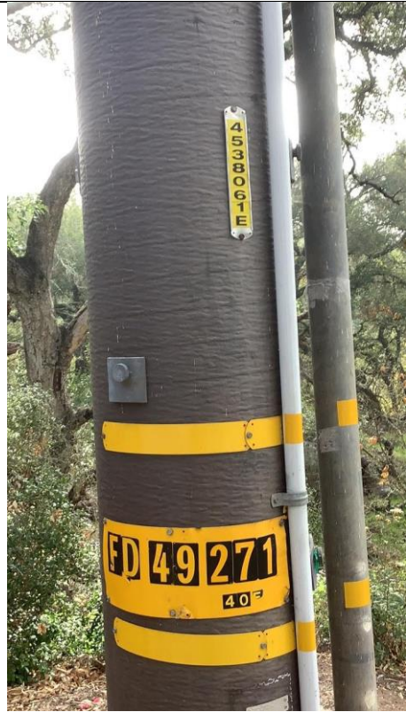
Item3GImg2: Pole ID