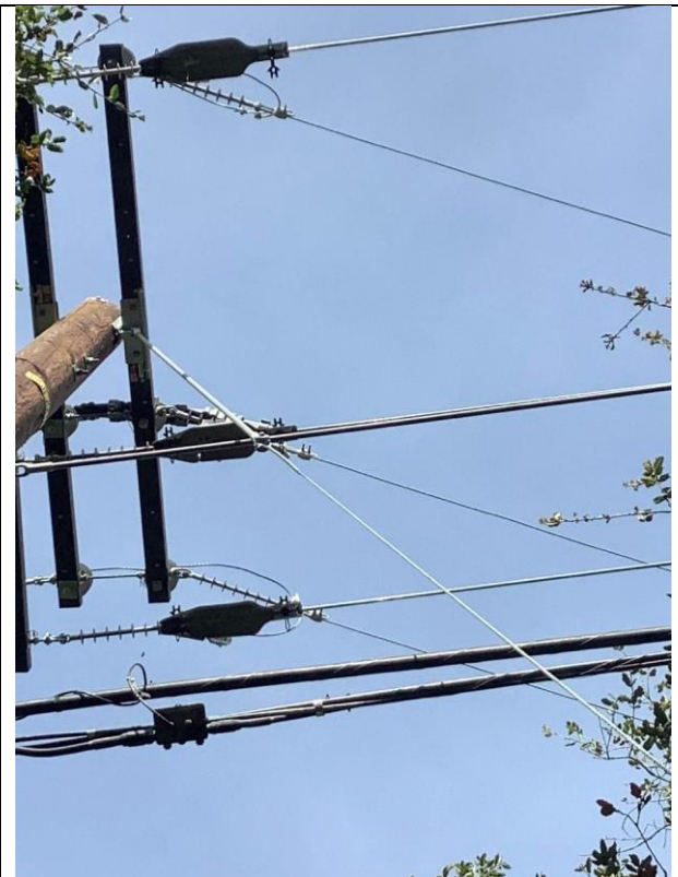
Item5IA1mg1: Bare wire