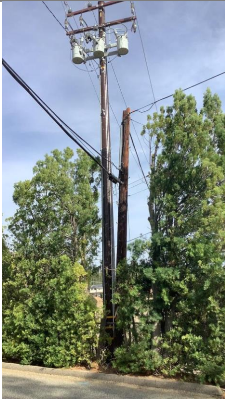
Item7GImg1: Overall pole