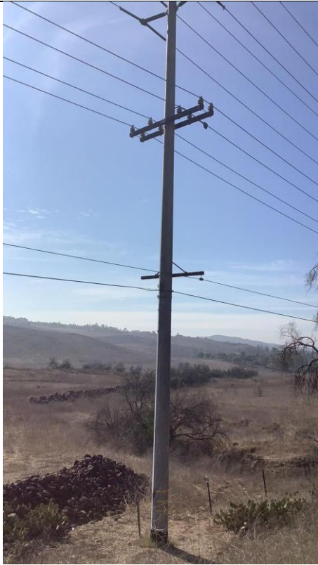
Item6GImg1: Overall pole