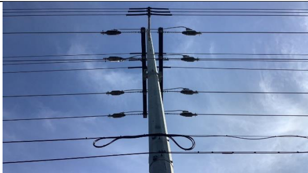
Item11IA1img1: Vibration dampers not installed