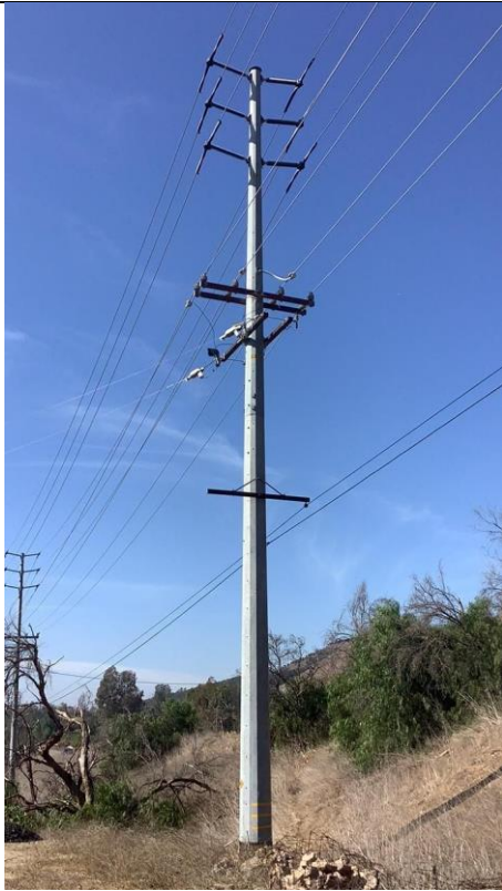
Item5GImg1: Overall pole