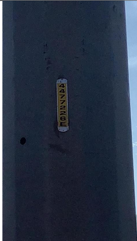
Item3GImg2: Pole ID