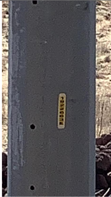
Item6GImg2: Pole ID