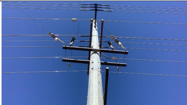
Item5IA1img1: No vibration dampers installed