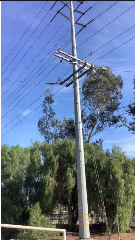
Item9GImg1: Overall Pole