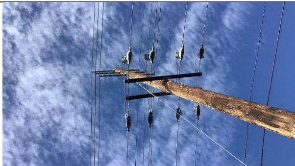
Item1IA1Img1: No vibration dampers installed