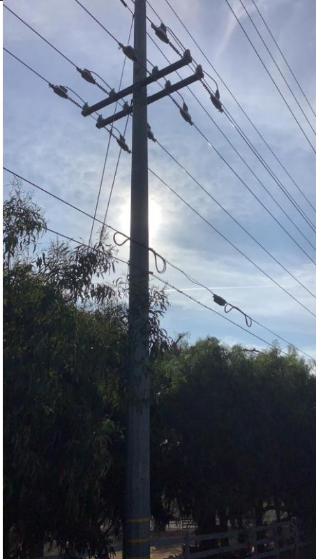
Item11GImg1: Overall pole