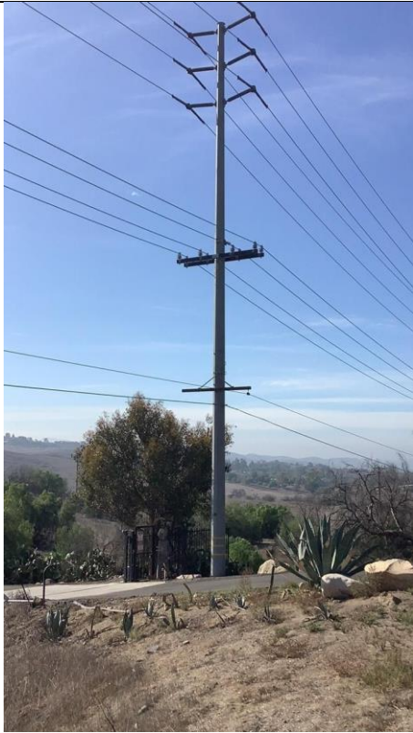
Item4GImg1: Overall pole