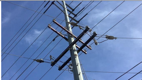
Item9IA1img1: No vibration dampers installed