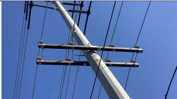
Item7IA1img1: Vibration dampers not installed