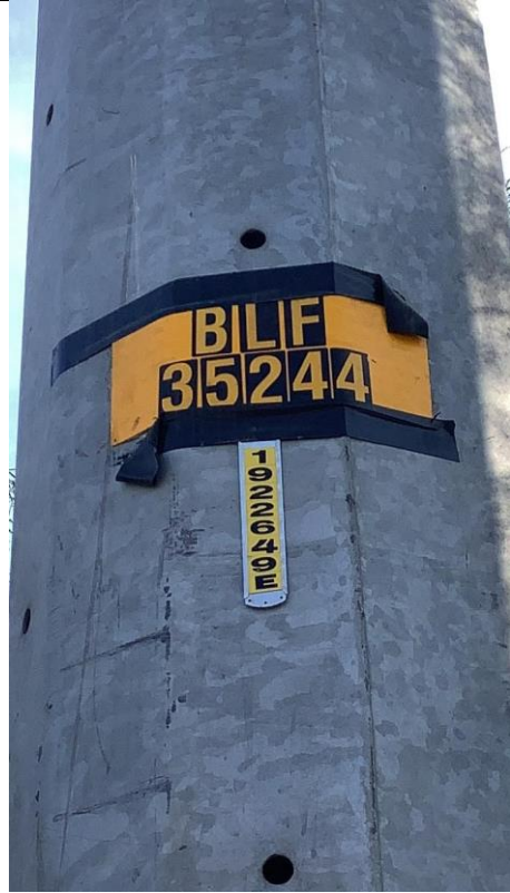
Item12G1mg2: Pole ID