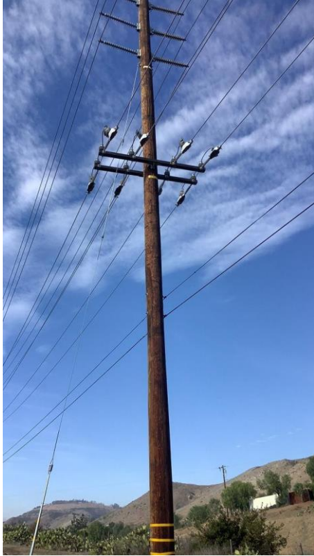
Item1GImg1: Overall photo