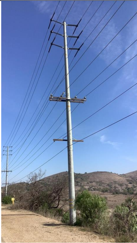
Item7GImg1: Overall Pole