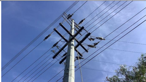
Item12IA1mg1: No vibration dampers installed