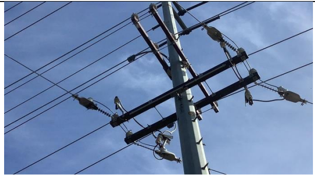
Item9VG2Img2: Bird nest in end cap to left of photo