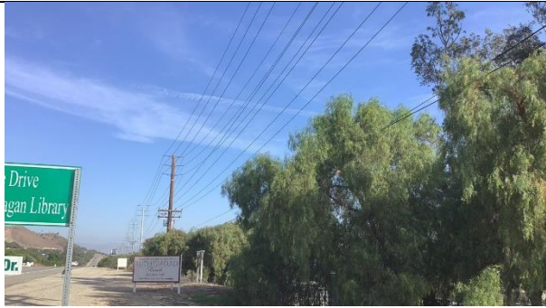
Item9IA3Img1: Vegetation overall view