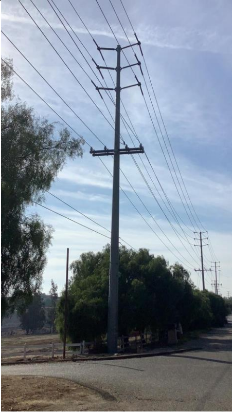
Item10GImg1: Overall Pole