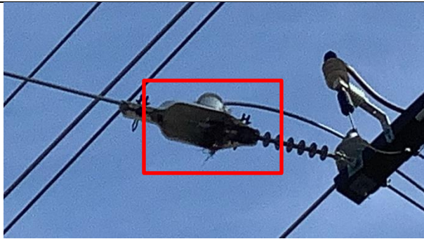
Item9VG2Img1: Bird nest close-up view