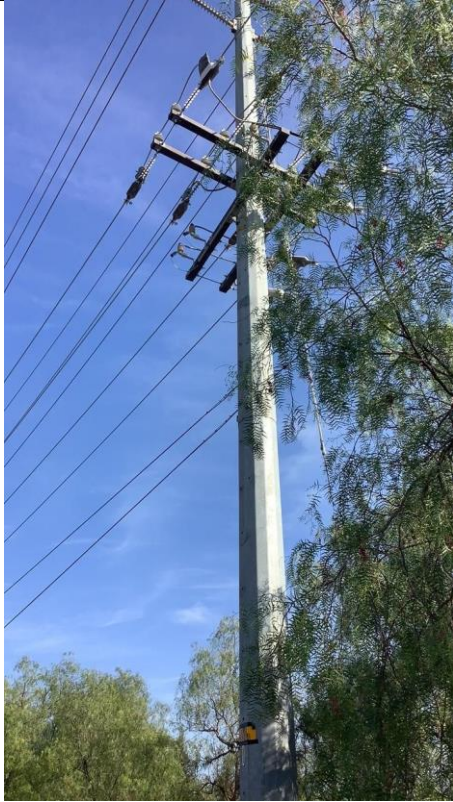
Item12G1mg1: Overall pole