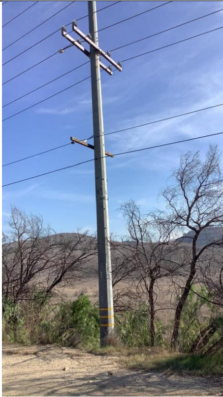
Item8GImg1: Overall Pole