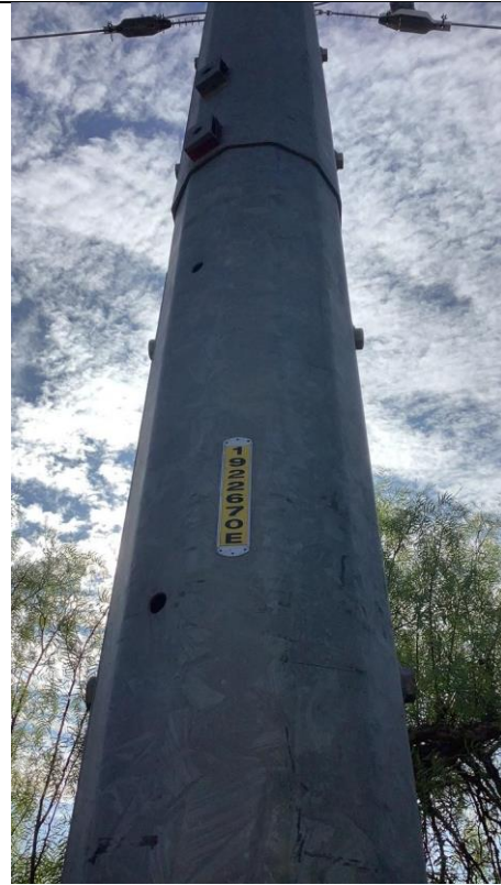
Item2GImg2: Pole ID