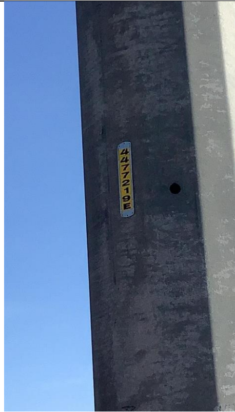
Item7GImg2: Pole ID