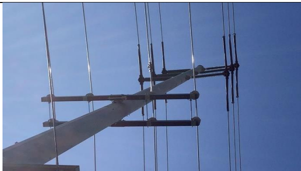
Item4IA1img1: No vibration dampers installed