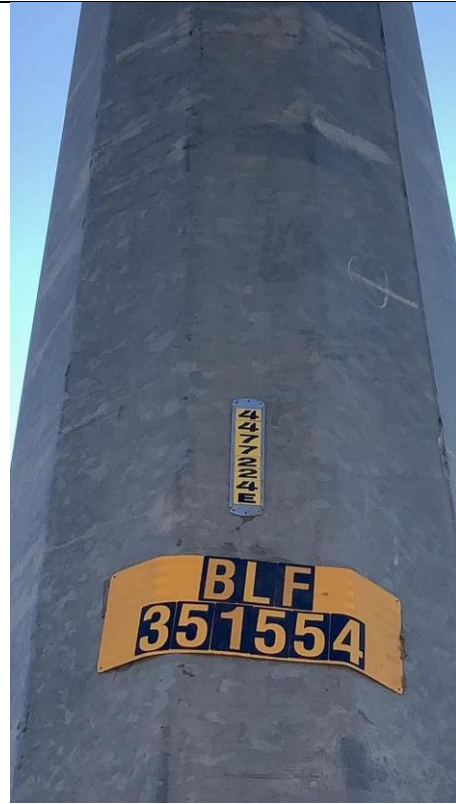
Item5GImg2: Pole ID