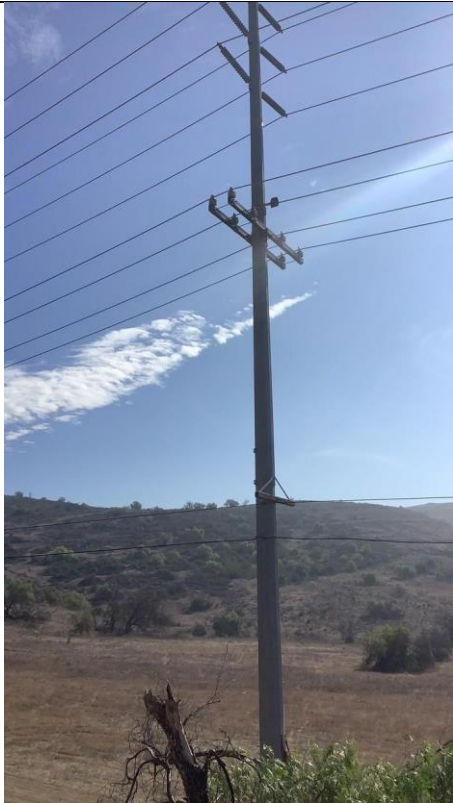
Item3GImg1: Overall Pole