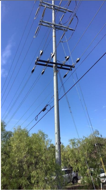
Item2GImg1: Overall photo