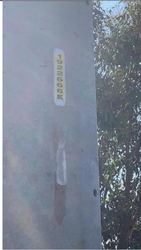
Item4GImg2: Pole ID