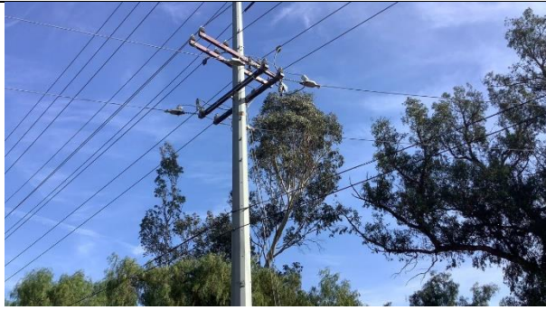
Item9IA2Img1: Overall pole