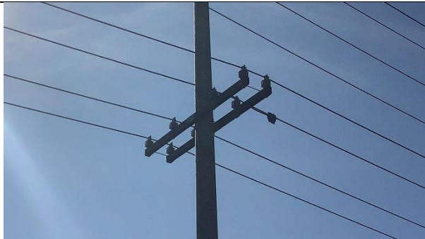
Item6IA1Img1: Vibration dampers not installed