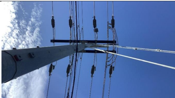
Item2IA1Img1: No vibration dampers installed