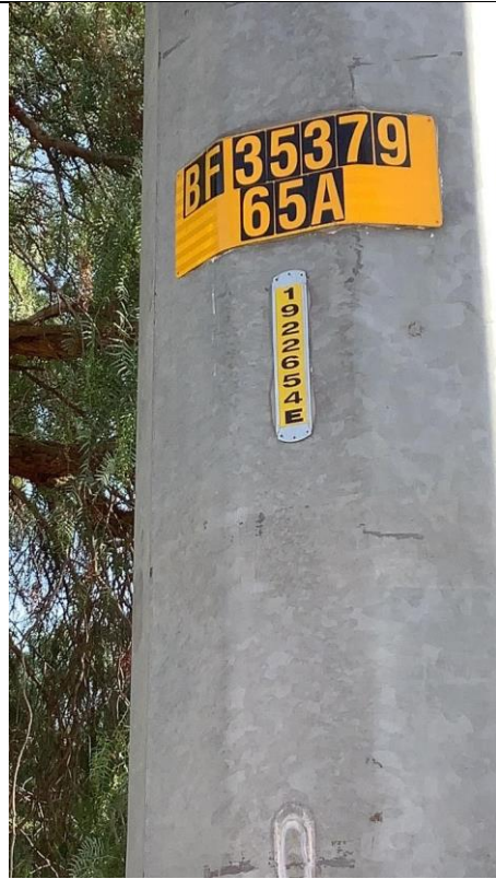
Item9GImg2: Pole ID