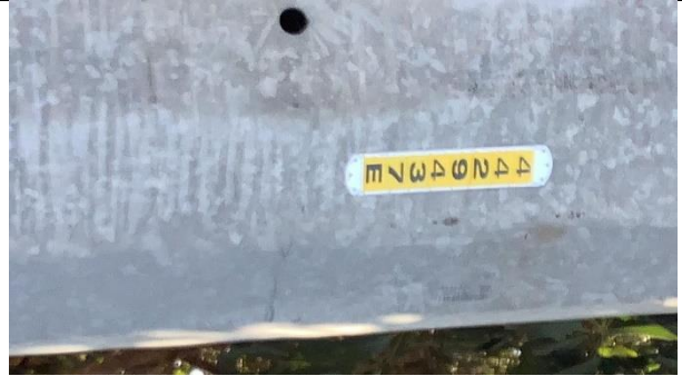
Item11GImg2: Pole ID