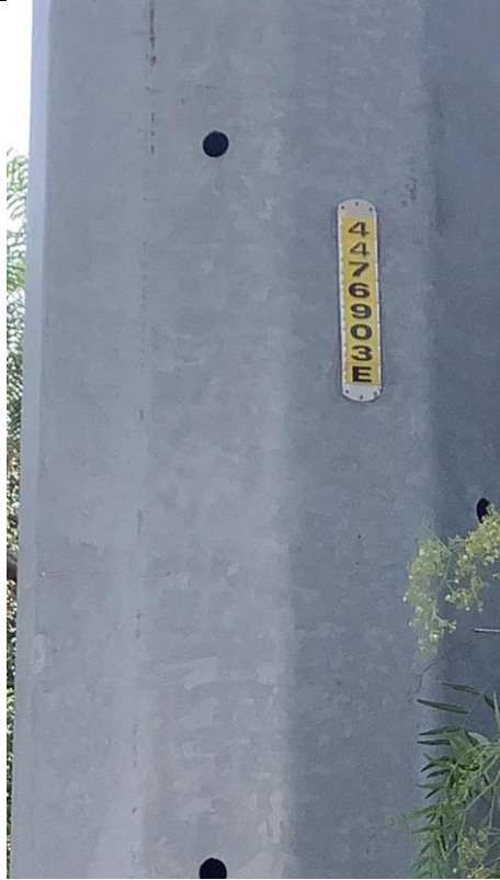
Item10GImg2: Pole ID