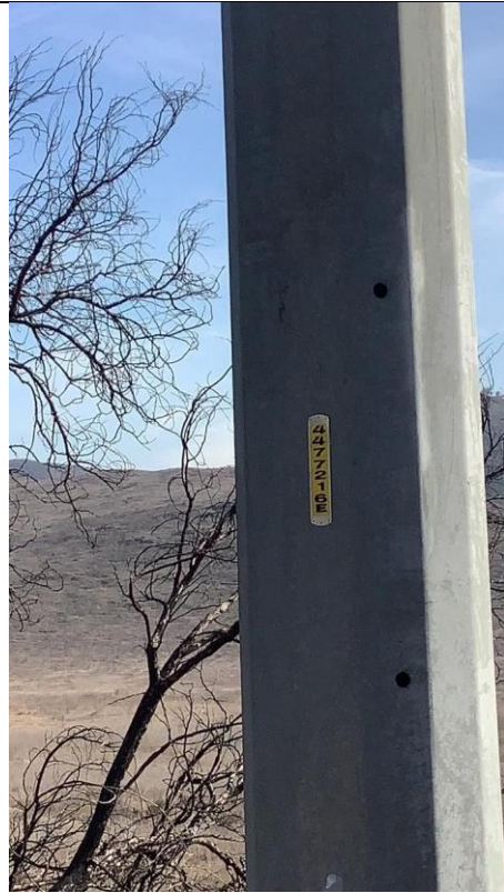
Item8GImg2: Pole ID