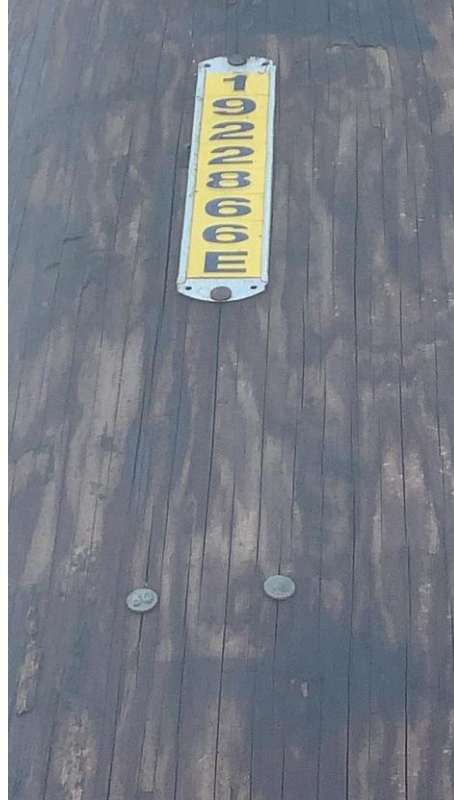
Item1GImg2: Pole ID