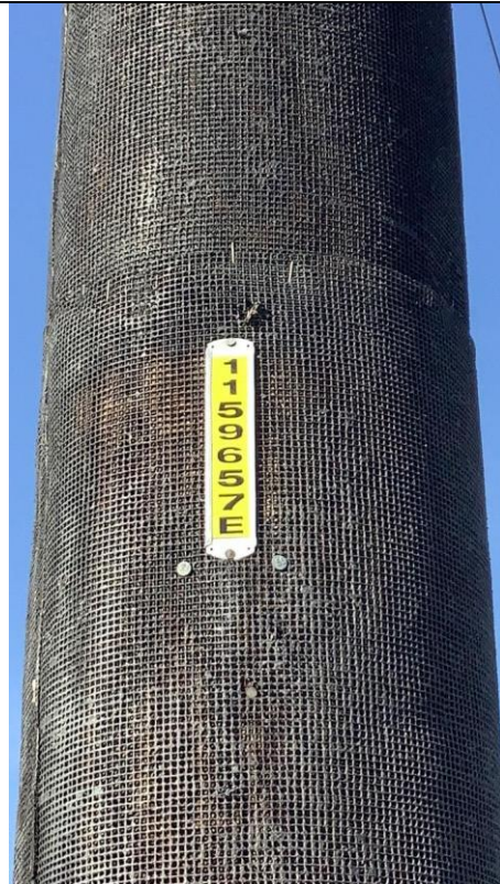
Item12GImg2: Pole ID