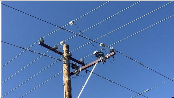
Item9IA1img1: Overall crossarm