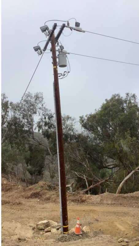
Item6GImg1: Overall pole