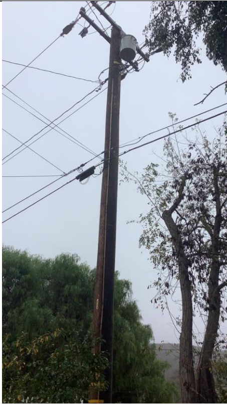
Item4GImg1: Overall pole