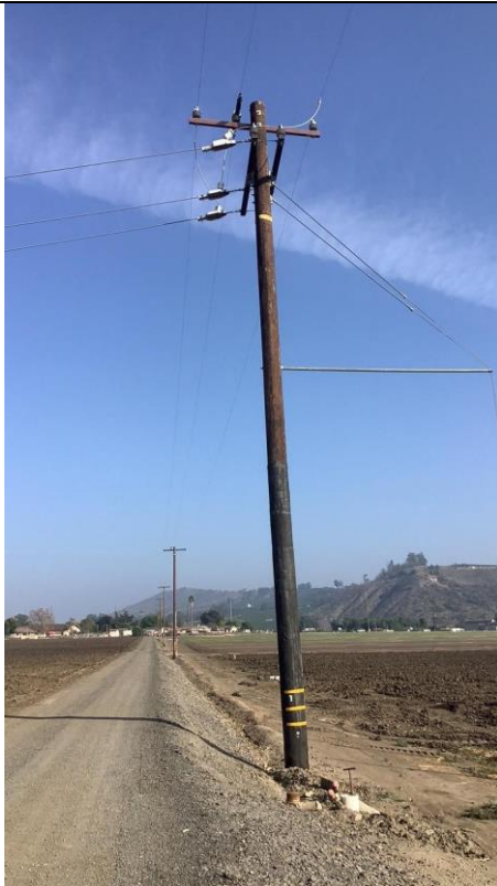
Item12GImg1: Overall Pole