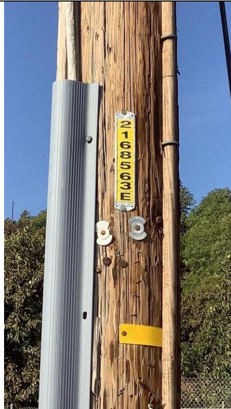
Item13GImg2: Pole ID