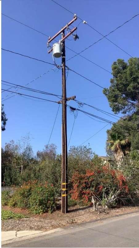
Item11GImg1: Overall pole