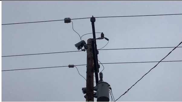
Item2IA1Img1: Vibration dampers not installed