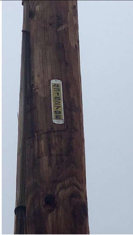
Item3GImg1: Overall pole