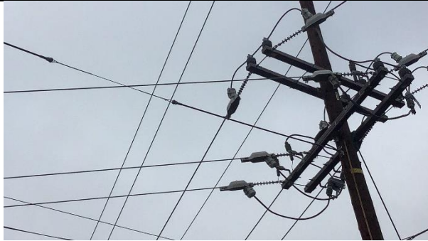
Item7IA1Img1: Vibration dampers not installed