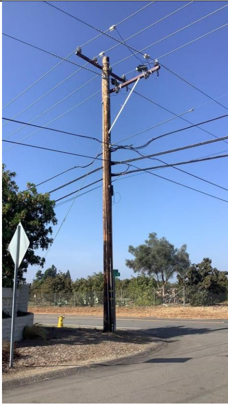
Item9GImg1: Overall pole