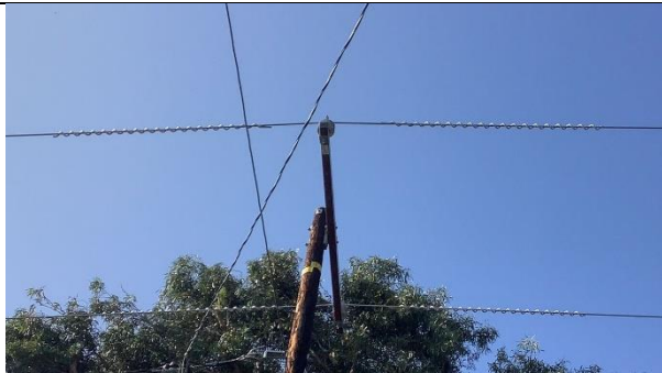
Item10IA1Img1: Overall crossarm