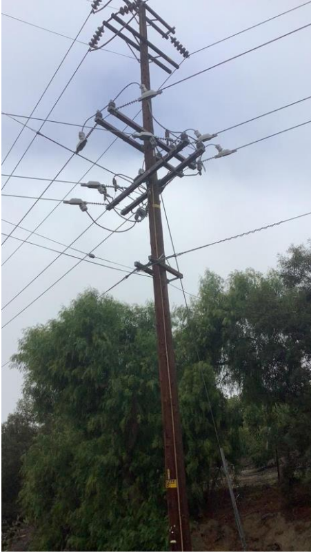
Item7GImg1: Overall Pole