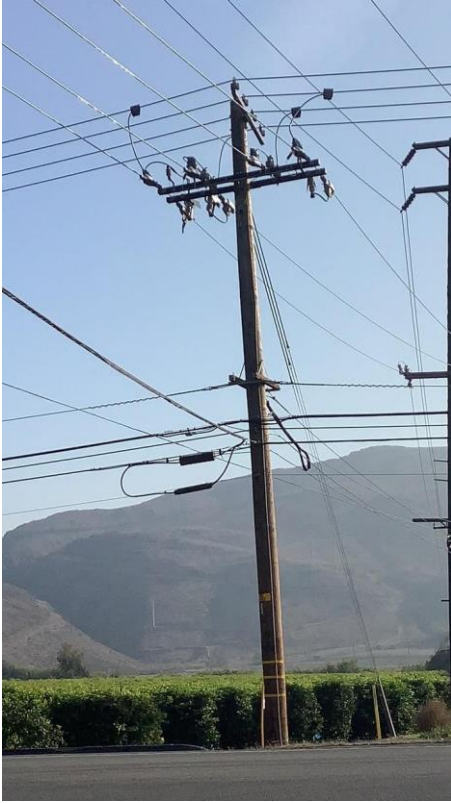
Item14Gimg1: Overall pole