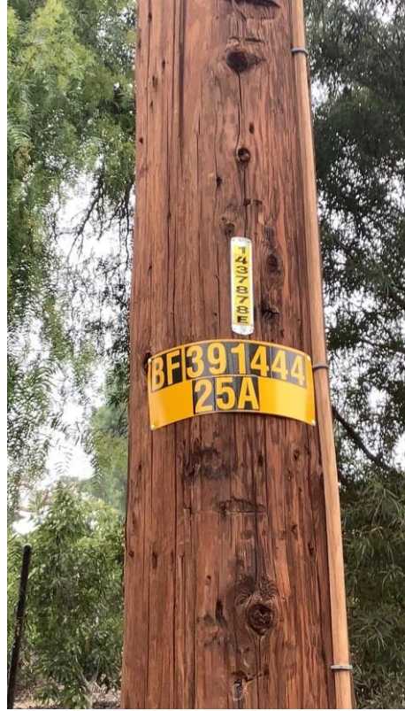
Item7GImg2: Pole ID