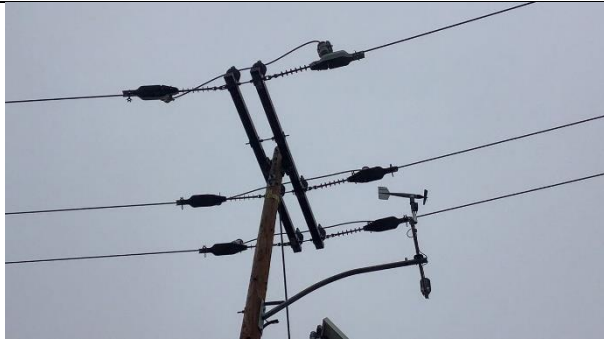
Item3IA2Img1: Vibration dampers not installed