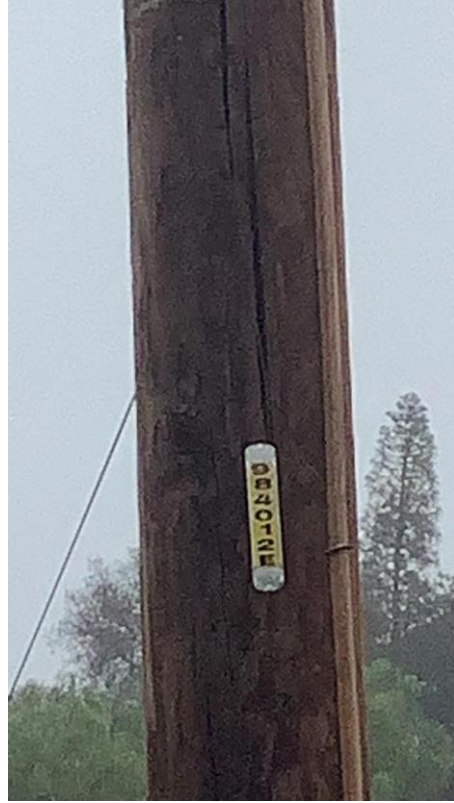
Item2GImg2: Pole ID