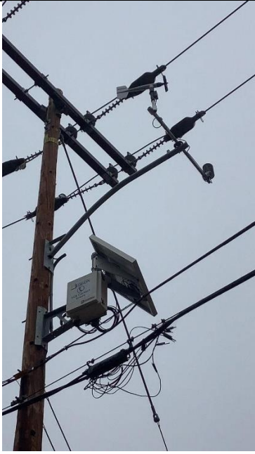
Item3IA1Img1: Weather station