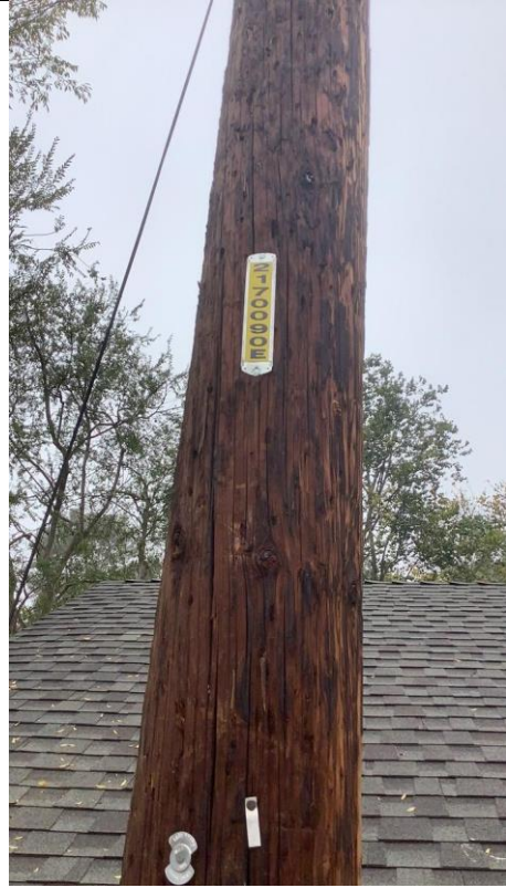
Item5GImg2: Pole ID