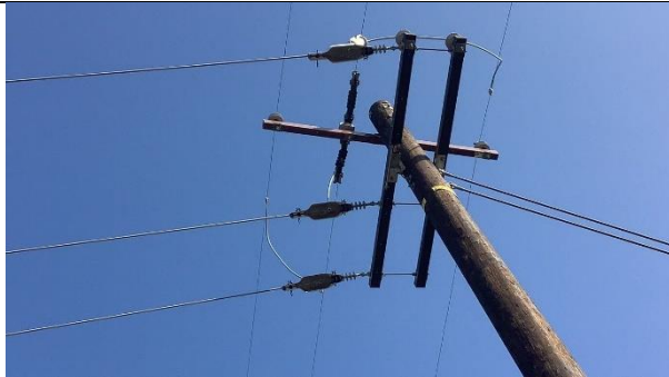
Item12IA1Img1: Vibration dampers not installed