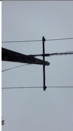
Item5IA1mg1: Failure to install vibration dampers