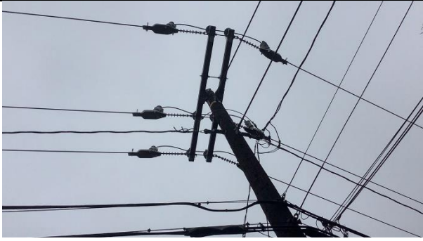
Item1IA1mg1: Vibration dampers not installed