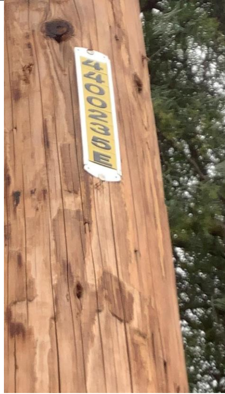
Item8GImg2: Pole ID