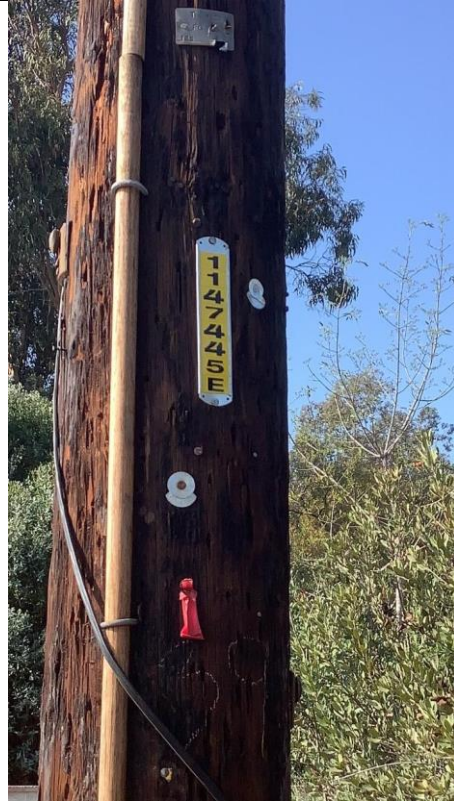
Item11GImg2: Pole ID