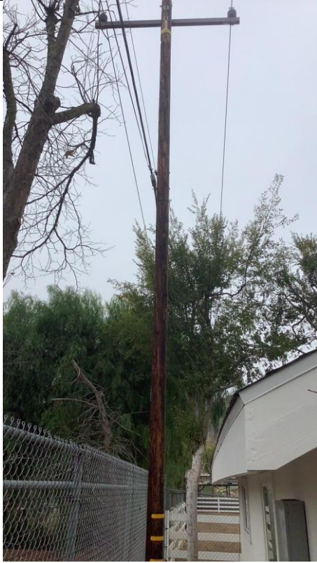
Item5GImg1: Overall pole