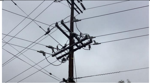
Item7IA1Img2: Overall CC