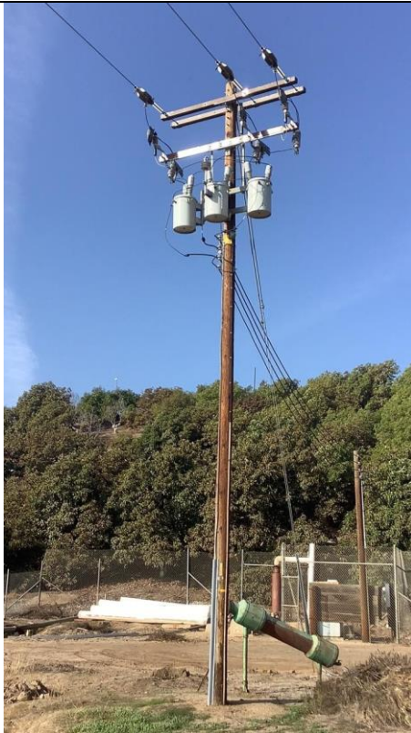
Item13GImg1: Overall pole