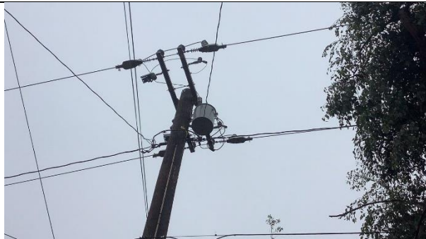
Item4IA1Img1: Vibration dampers not installed