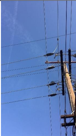
Item14IA1img1: Vibration dampers not installed