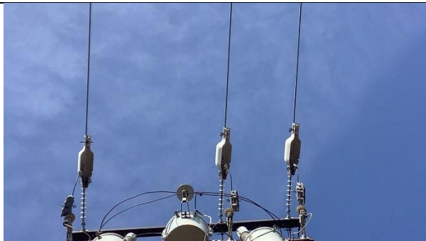
Item13IA1img1: Vibration dampers not installed