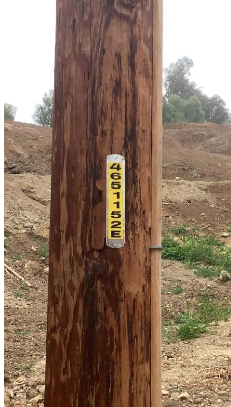
Item6GImg2: Pole ID