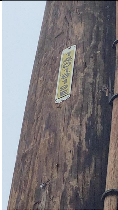
Item4GImg2: Pole ID