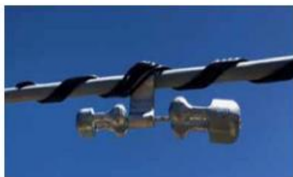
Figure 1: Stockbridge Damper

Installing vibration dampers on the covered conductor mitigates Aeolian vibration by protecting the covered conductor from abrasion and fatigue damage. The vibration damper standard was put into effect in October 2020 and is required for all covered conductors in light loading areas (elevation below 3,000 feet). Recently, SCE has been experiencing an acute shortage of Stockbridge Dampers (refer to Figure 1) for 336 ACSR Covered Conductor due to the high demand and supplier constraints. Additionally, the spiral vibration dampers (refer to Figure 2) for 1/0 ACSR, #2 Copper, and 2/0 Copper may be running low on stock.