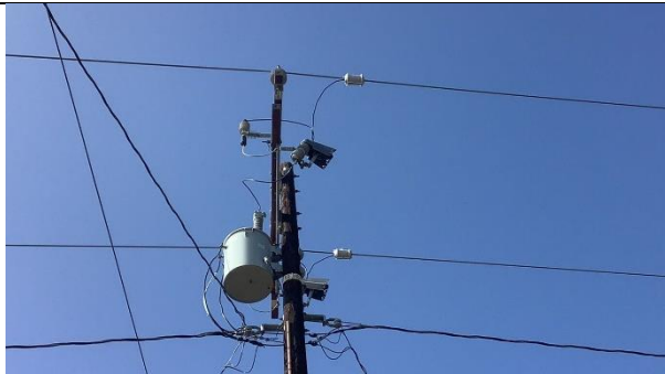
Item11IA1img1: Vibration dampers not installed