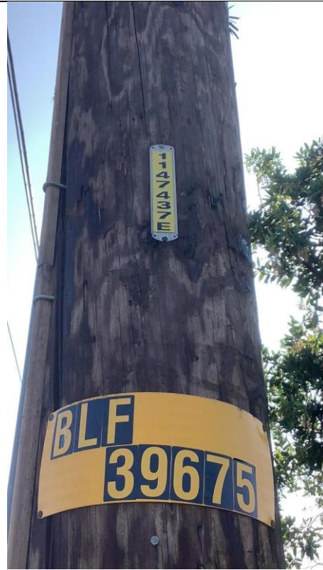
Item9GImg2: Pole ID