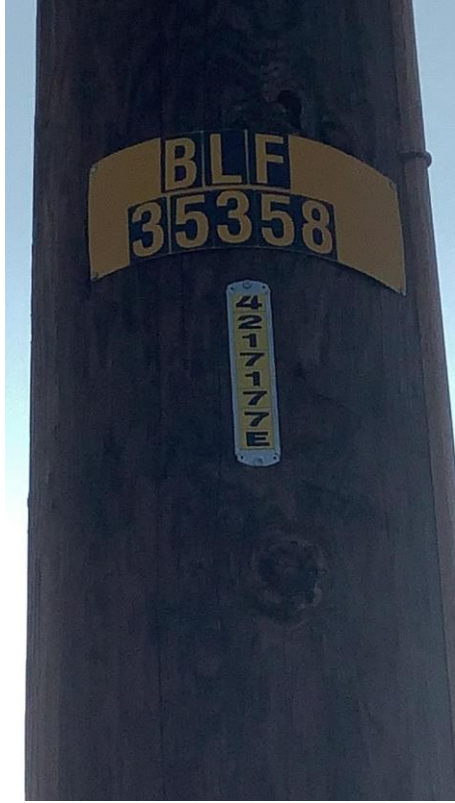
Item14Gimg2: Pole ID