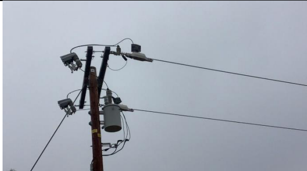
Item6IA1Img1: Vibration dampers not installed