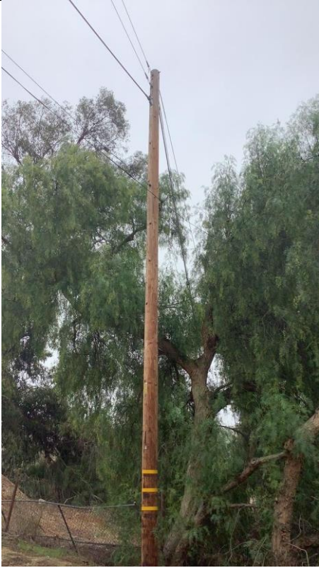
Item8GImg1: Overall Pole