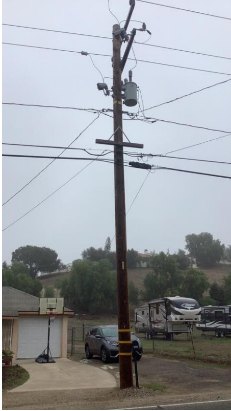
Item2GImg1: Overall pole