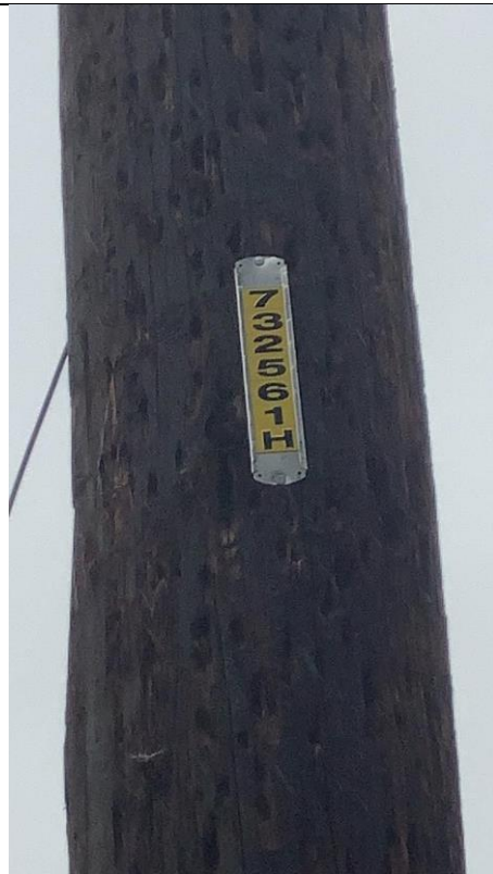
Item1GImg2: Pole ID