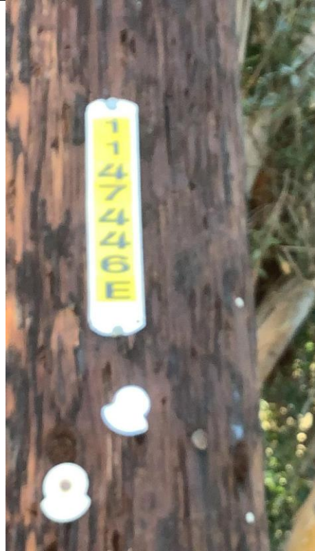
Item10GImg2: Pole ID