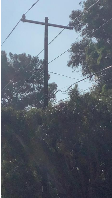
Item10GImg1: Overall pole