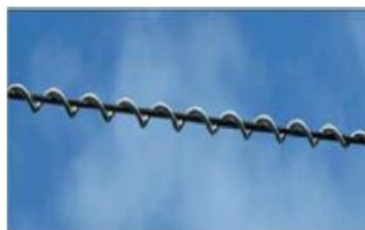
Figure 2: Spiral Damper