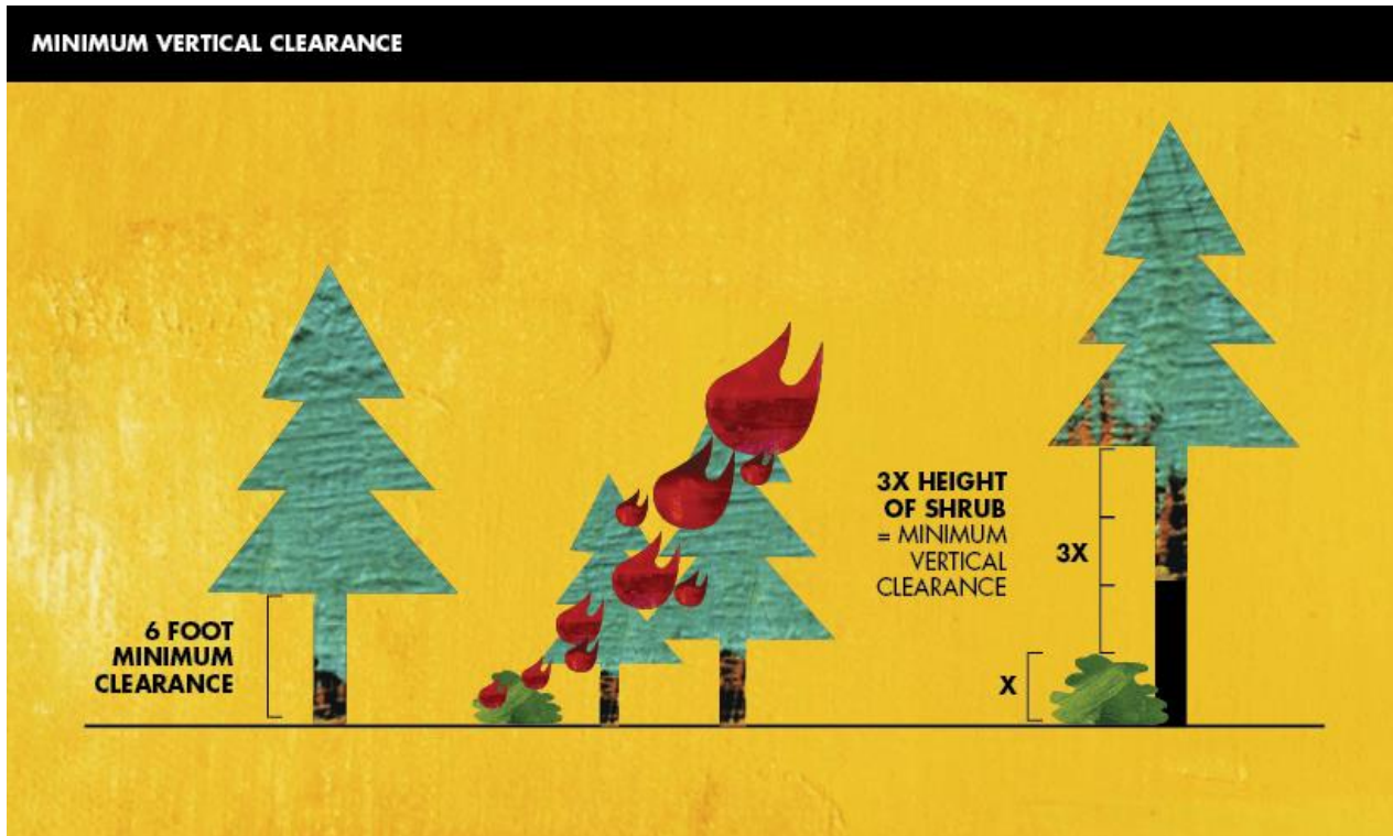
Figure 3. A Five Foot Shrub is Growing Near a Tree. 3 \times 5 = 15 feet of clearance needed between the top the shrub and the lowest tree branch