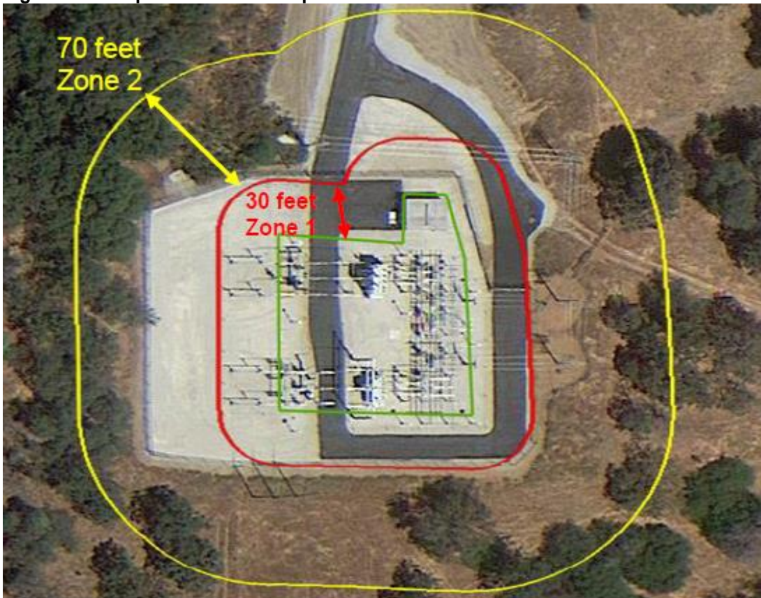
Figure 1. Example of Defensible Space Zones