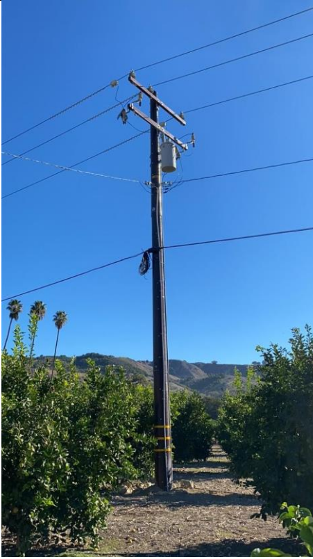
Item4GImg1: Overall pole