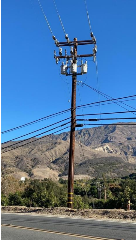
Item2GImg1: Overall pole