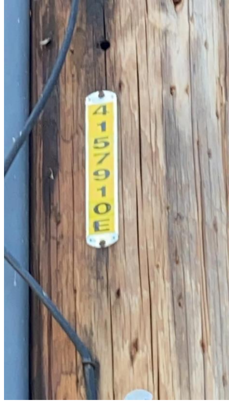
Item12GImg2: Pole ID