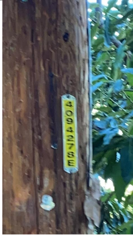
Item11Gimg2: Pole ID