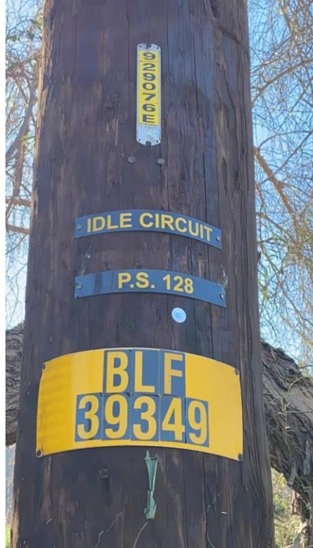
Item7GImg2: Pole ID