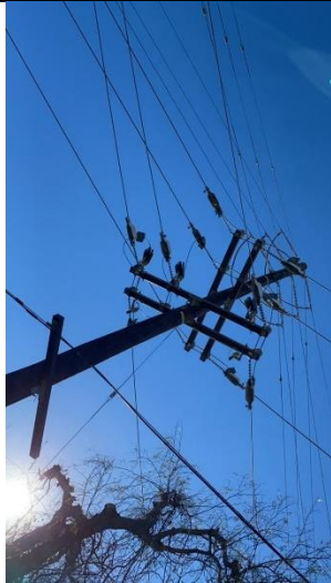
Item7IA1Img1: Vibration dampers not installed