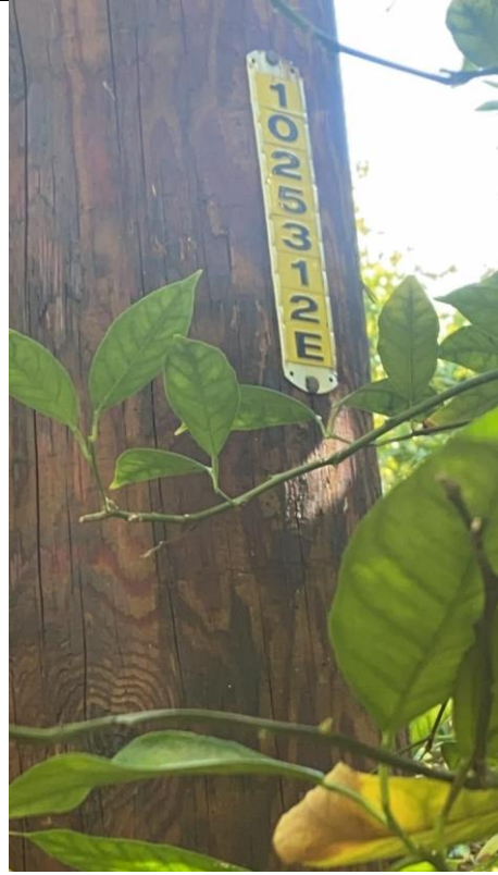
Item15GImg2: Pole ID