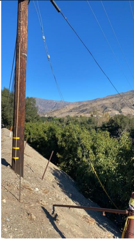
Item2GW1Img1: Overview of pole with loose down guy wire