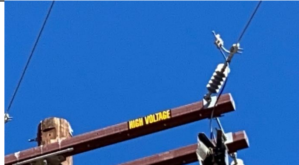
Item13IA1Img2: Bare wire to covered conductor close up