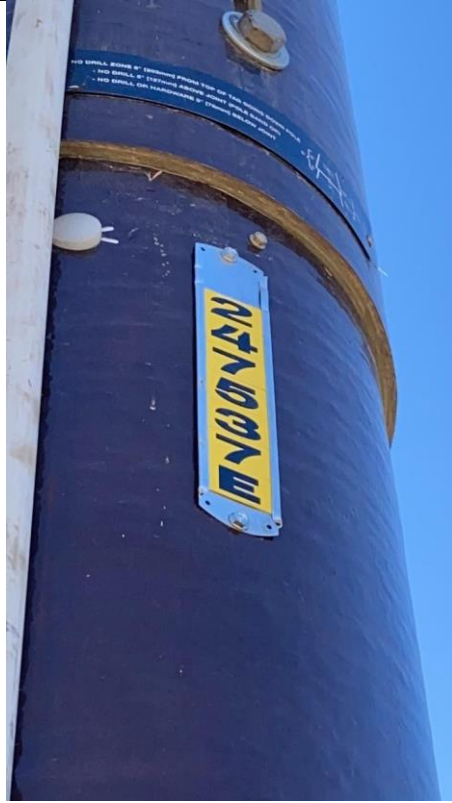
Item5GImg2: Pole ID