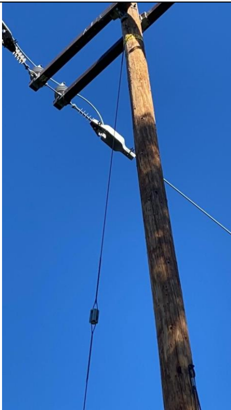
Item11IA2Img1: Fiberglass down guy wire insulator not installed