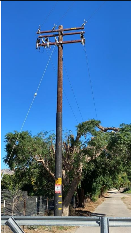
Item13GImg1: Overall pole