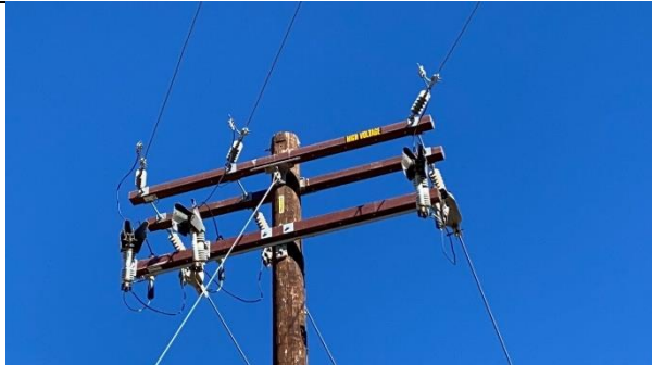
Item13IA1Img1: Bare wire to covered conductor