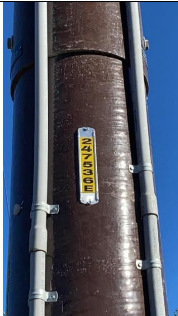
Item4GImg3: Pole ID