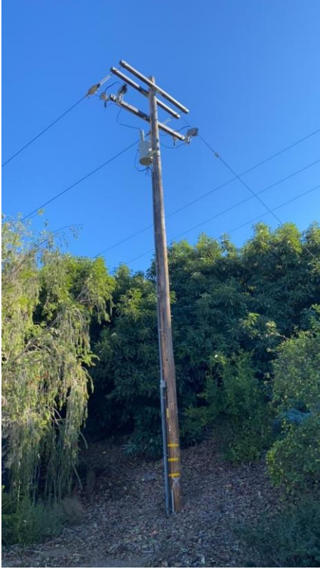
Item12GImg1: Overall pole