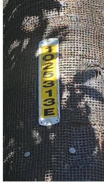
Item16GImg2: Pole ID