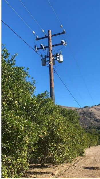
Item16GImg1: Overall pole