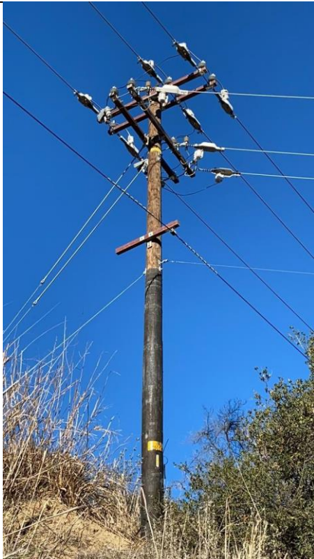
Item1GImg1: Overall pole