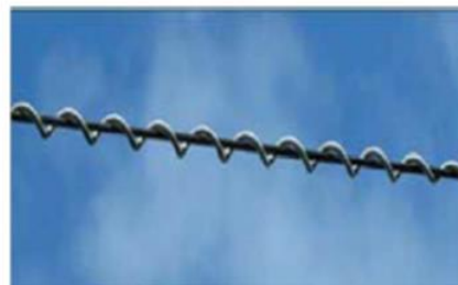
Figure 2: Spiral Damper