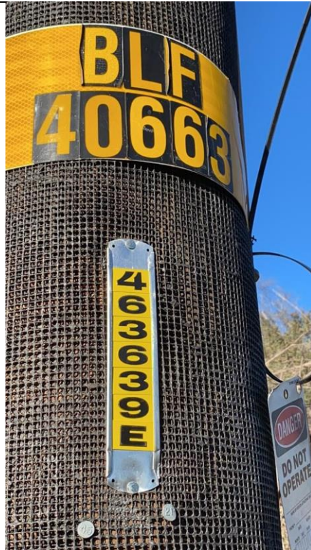
Item1GImg2: Pole ID