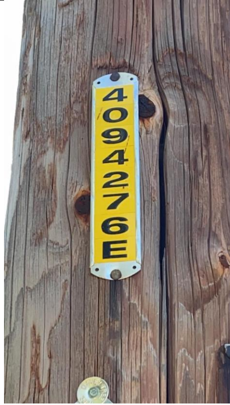
Item9GImg2: Pole ID