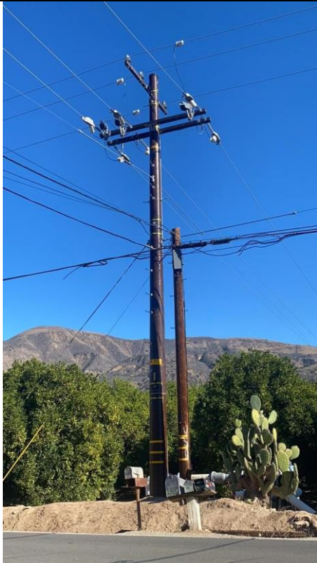
Item14GImg1: Overall pole