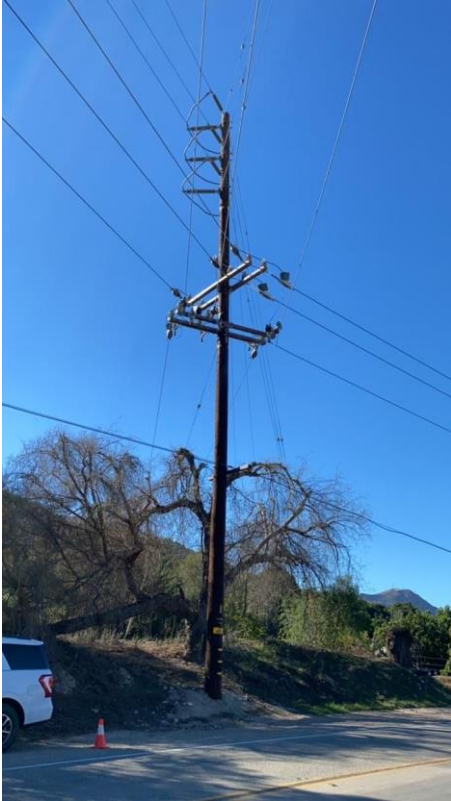
Item7GImg1: Overall pole