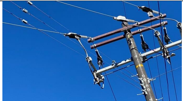
Item6IA1Img2: Close up of 3 guy spans with porcelain insulators