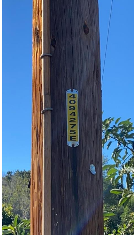
Item8GImg2: Pole ID