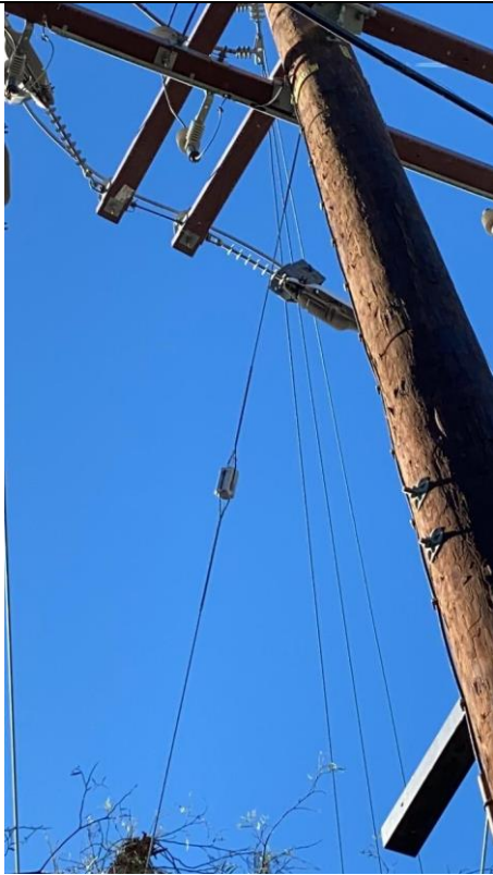
Item7IA2Img1 : Fiberglass down guy wire insulator not installed