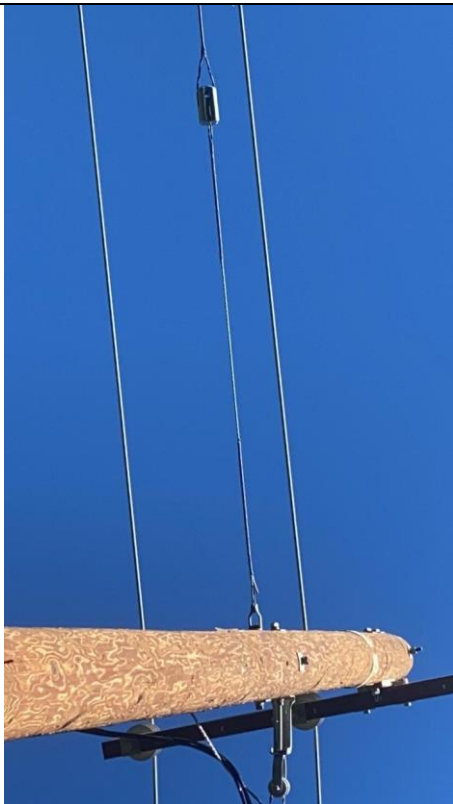
Item15IA2Img1: : Fiberglass span guy wire insulator not installed