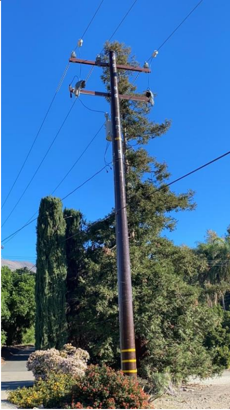
Item5GImg1: Overall pole