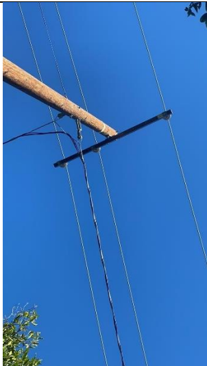
Item15IA1Img1: Vibration dampers not installed