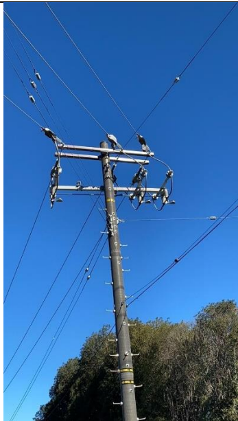
Item6IA1Img1: Overall of 6 guy spans with porcelain insulators