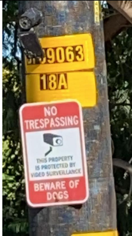
Item13GImg2: Pole ID