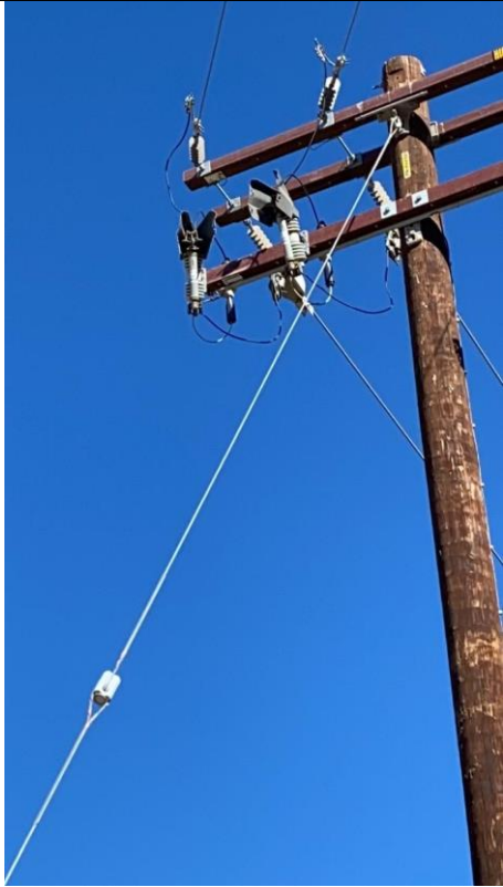
Item13IA2Img1 : : Fiberglass down guy wire insulator not installed