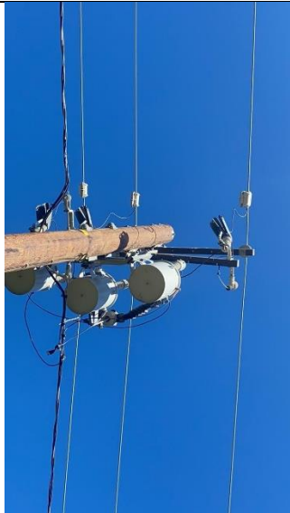
Item16IA1Img1: No vibration dampers installed