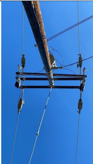
Item8IA1Img1: Vibration dampers not installed