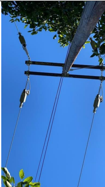
Item10IA1Img1: Vibration dampers not installed