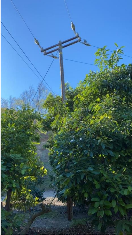
Item10GImg1: Overall pole