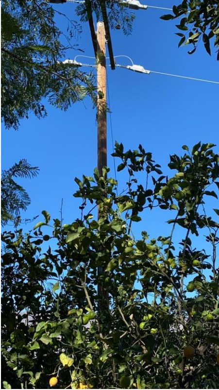
Item11Gimg1: Overall pole