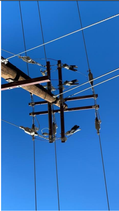
Item1IA1img1: Vibration dampers not installed