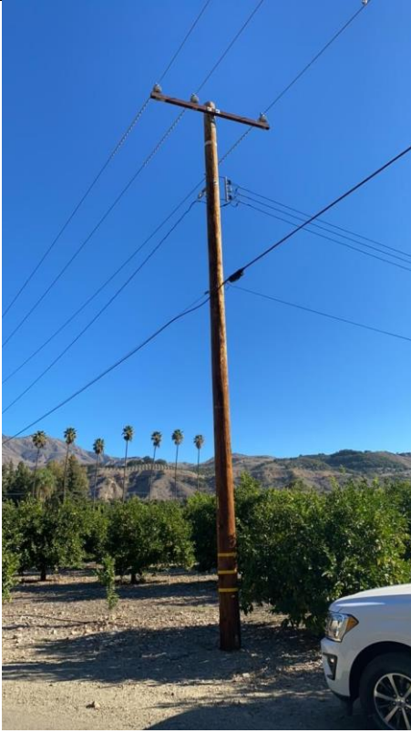
Item3GImg1: Overall pole