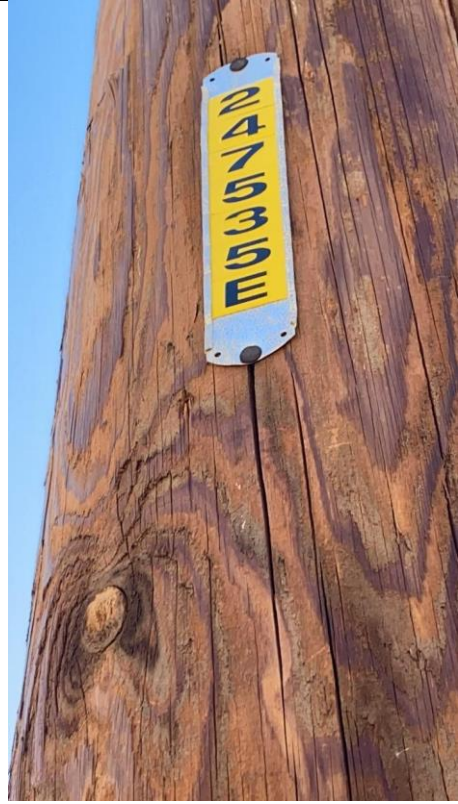
Item3GImg2: Pole ID