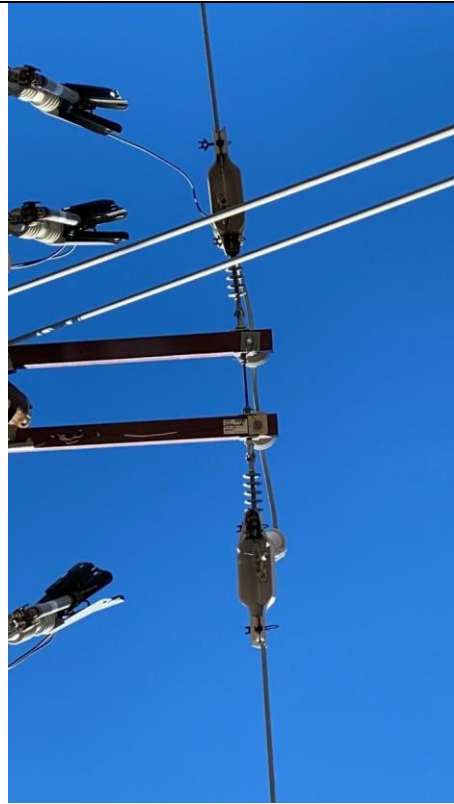
Item1IA1img2: Close up, no vibration dampers installed