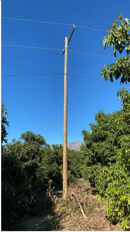
Item9GImg1: Overall pole