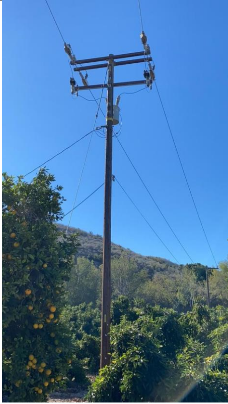
Item8GImg1: Overall pole