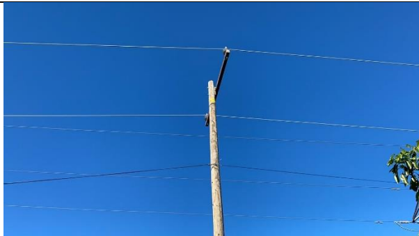
Item9IA1img1: Vibration dampers not installed