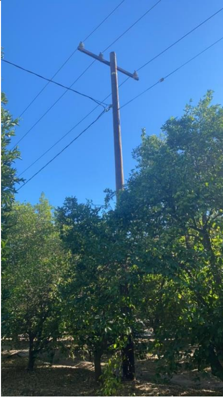
Item15GImg1: Overall pole