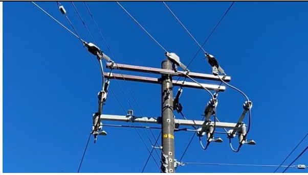
Item6IA2Img1: Vibration dampers not installed