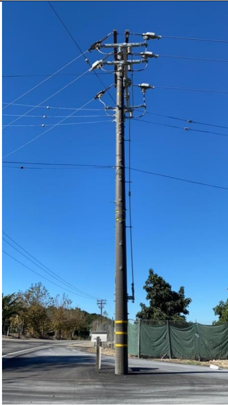
Item6GImg1: Overall pole