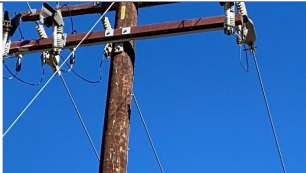
Item13IA3Img1 : Vibration dampers not installed