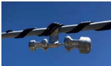
Figure 1: Stockbridge Damper

Installing vibration dampers on the covered conductor mitigates Aeolian vibration by protecting the covered conductor from abrasion and fatigue damage. The vibration damper standard was put into effect in October 2020 and is required for all covered conductors in light loading areas (elevation below 3,000 feet). Recently, SCE has been experiencing an acute shortage of Stockbridge Dampers (refer to Figure 1) for 336 ACSR Covered Conductor due to the high demand and supplier constraints. Additionally, the spiral vibration dampers (refer to Figure 2) for 1/0 ACSR, #2 Copper, and 2/0 Copper may be running low on stock.