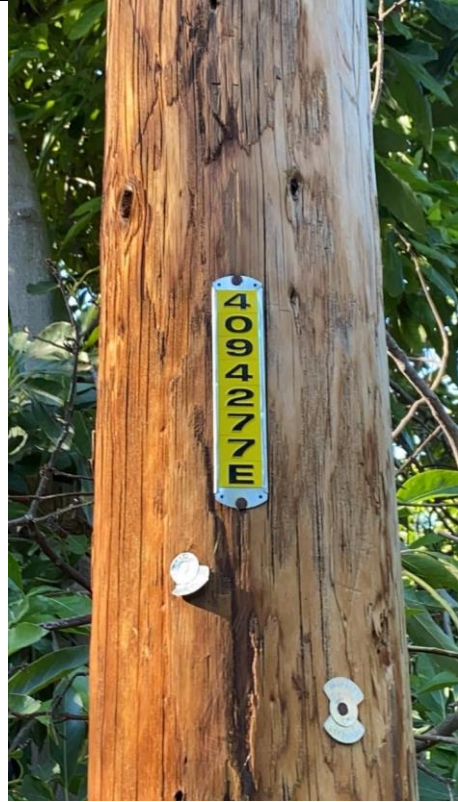
Item10GImg2: Pole ID