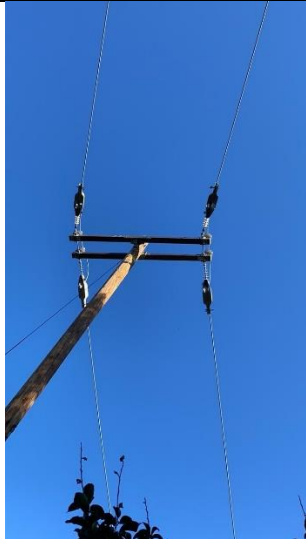
Item11IA1img1: Vibration dampers not installed