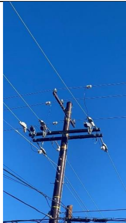
Item14IA1Img1: Vibration dampers not installed