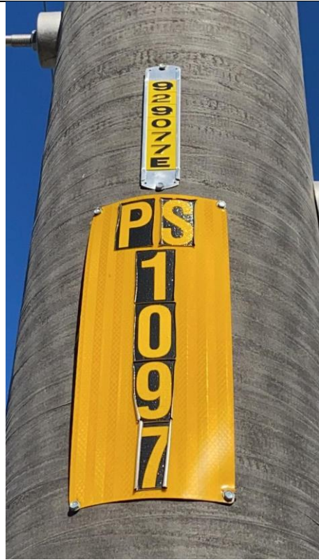
Item6GImg2: Pole ID