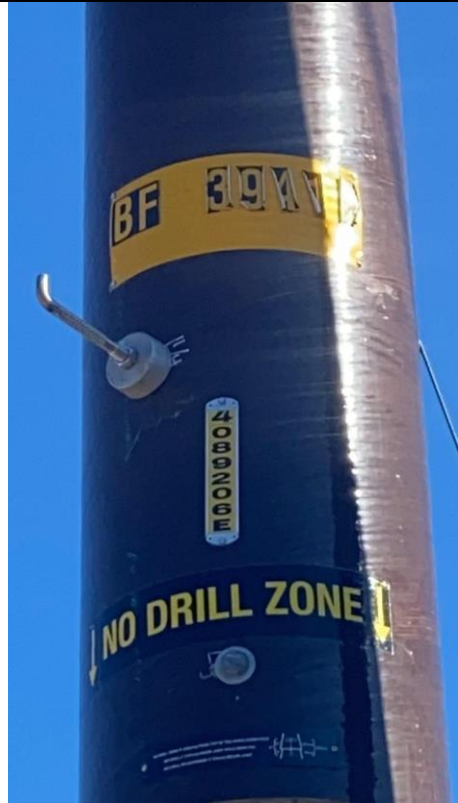
Item14GImg2: Pole ID