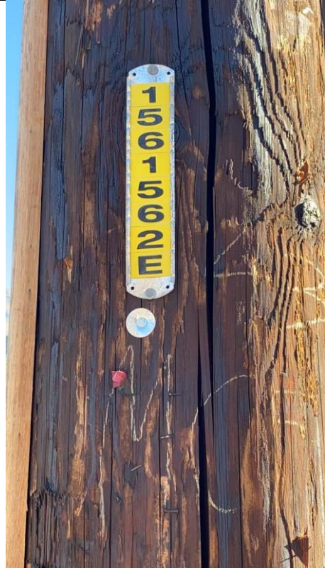
Item2GImg2: Pole ID