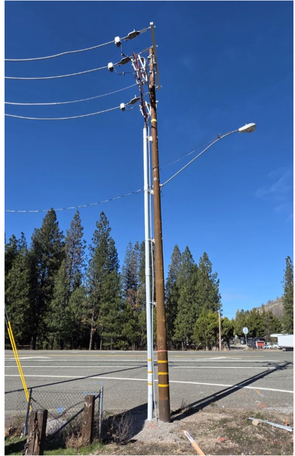
Picture 7-8: Near Pole ID 06241005.026600, Grid Hardening ID 8077661h at coordinates 41.4305141166174, -122.388788. Picture taken March 6, 2026.