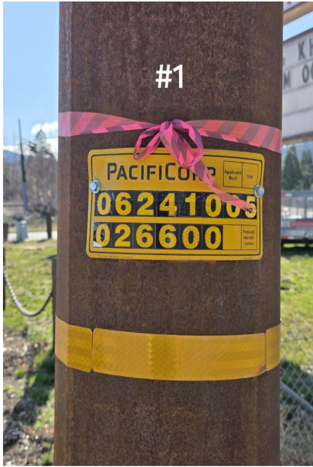
Pictures 1-2: Near Pole ID 06241005.026600, Grid Hardening ID 8077661h at coordinates 41.4305141166174, -122.388788. Picture taken March 6, 2026.