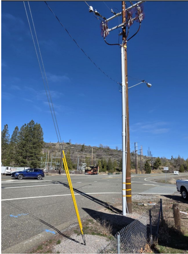
Picture 9: Near Pole ID 06241005.026600, Grid Hardening ID 8077661h at coordinates 41.4305141166174, -122.388788. Picture taken March 6, 2026.

PacifiCorp appreciates the opportunity to provide this response to Energy Safety's NODI_PAD_PC_BKA_20251008_1411.