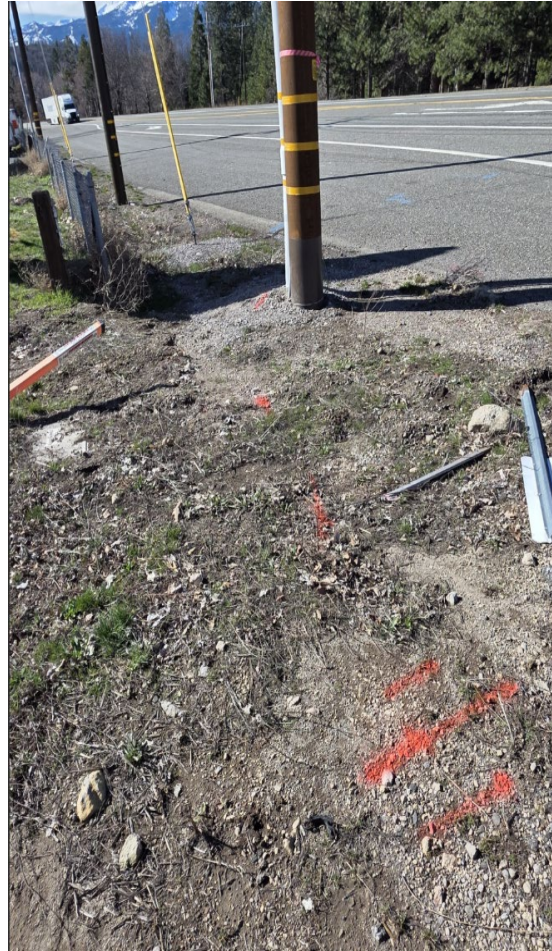
Pictures 3-4: Near Pole ID 06241005.026600, Grid Hardening ID 8077661h at coordinates 41.4305141166174, -122.388788. Picture taken March 6, 2026.