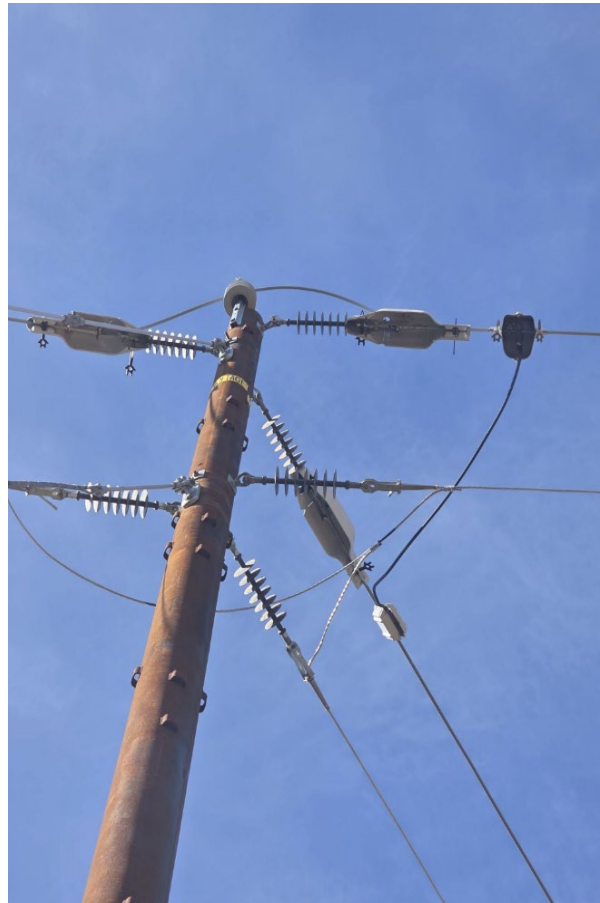
Picture 1-2: Near Pole ID 06237005.0354900, Grid Hardening ID 7171378 at coordinates 41.0288816033331, -122.413074. Picture taken March 6, 2026.