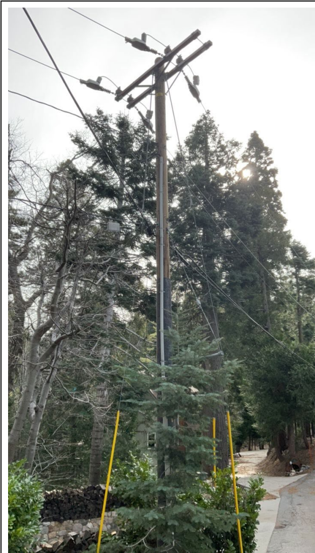
G1mg1: Overall structure