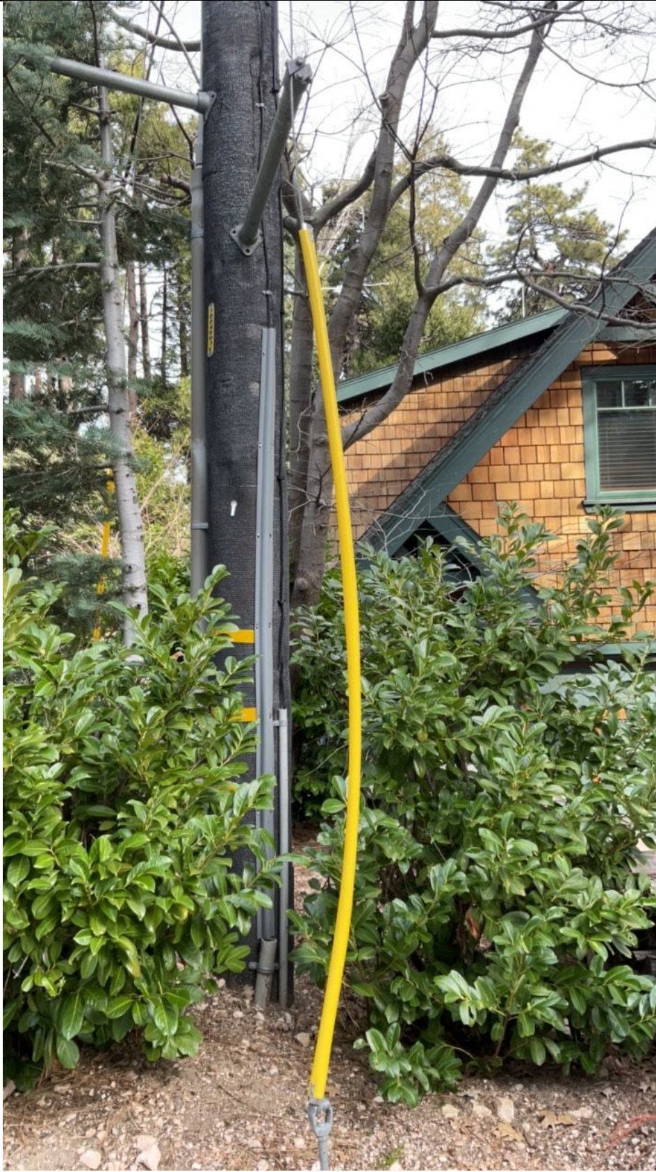
IA1Img1: Sagging communication down guy