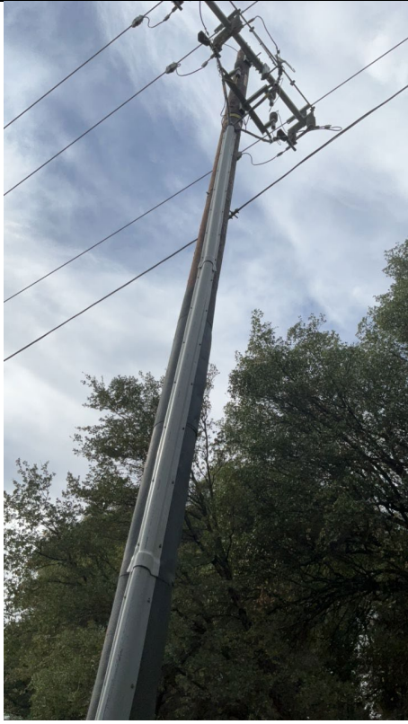
IA1Img3: Riser at the pole, no covered conductor installed east of Pole 121883227