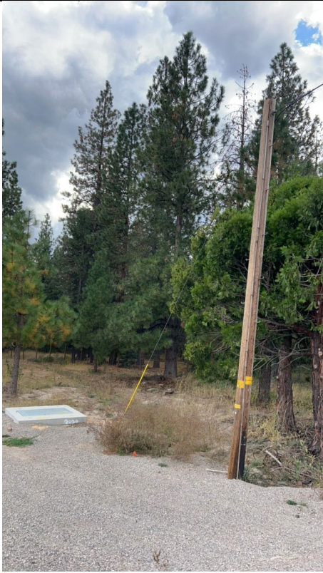
IA1Img1: South-facing view showing no CAL FIRE-approved non-expulsion fuses installed on Pole ID 06241005.025601