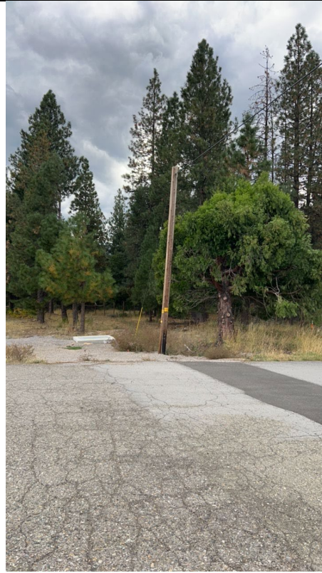
IA1Img2: South-facing long shot