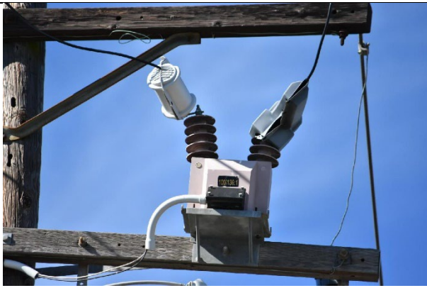
IA1img2: Capacitor bank avian protection cover dislodged