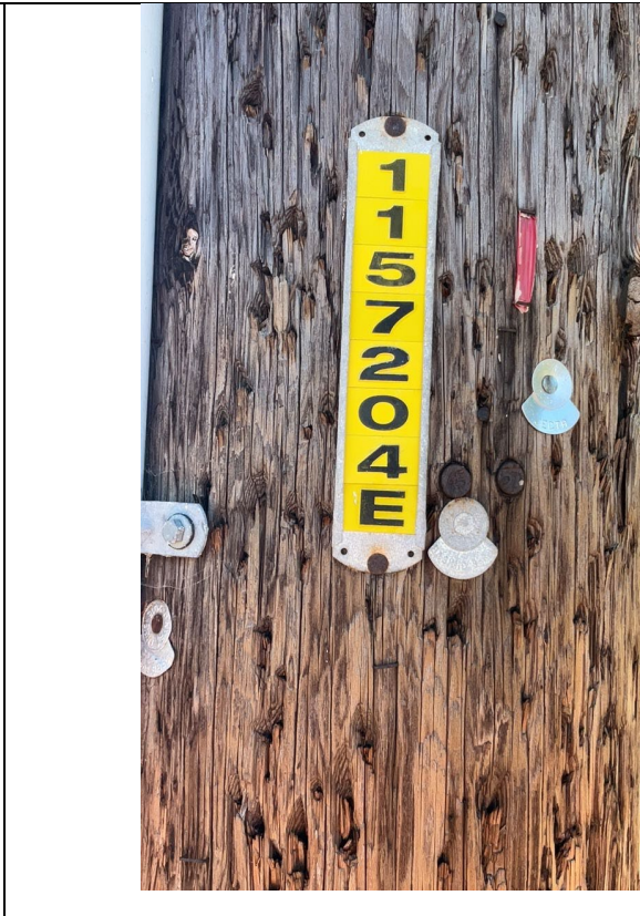
G1mg2: Structure ID