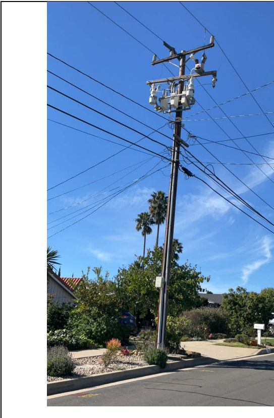
G1mg1: Overall Structure