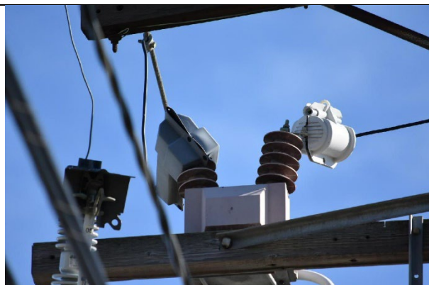
IA1Img4: Capacitor bank avian protection cover dislodged