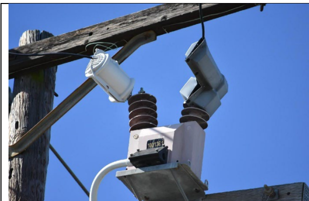
IA1Img3: Capacitor bank avian protection cover dislodged