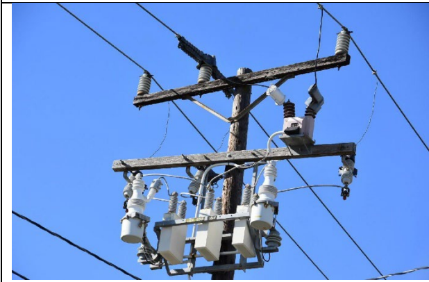
IA1img1: Capacitor bank avian protection cover dislodged