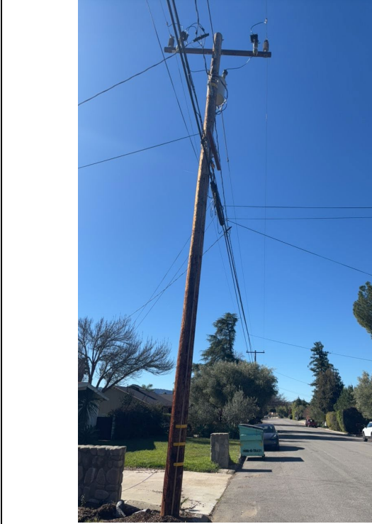
G1mg1: Overall Structure