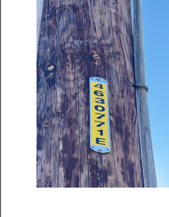
G1mg2: Structure ID