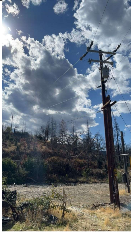
IA1Img2: No covered conductor installed heading northwest of Pole 06246009.135501.