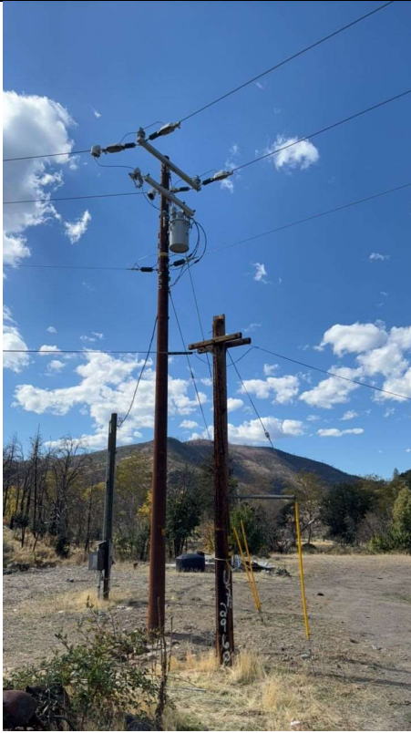
IA1Img1: No covered conductor installed heading northwest of Pole 06246009.135501.