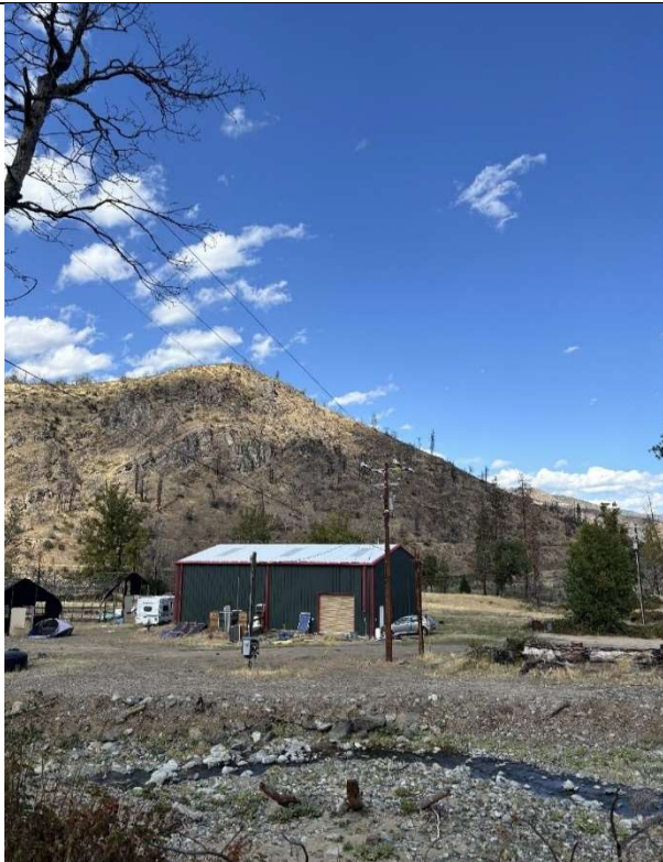
IA1Img3: No covered conductor installed heading northwest of Pole 06246009.135501.