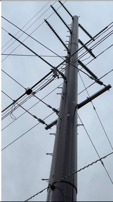
IA1Img1: No CAL FIRE-approved non expulsion fuses installed