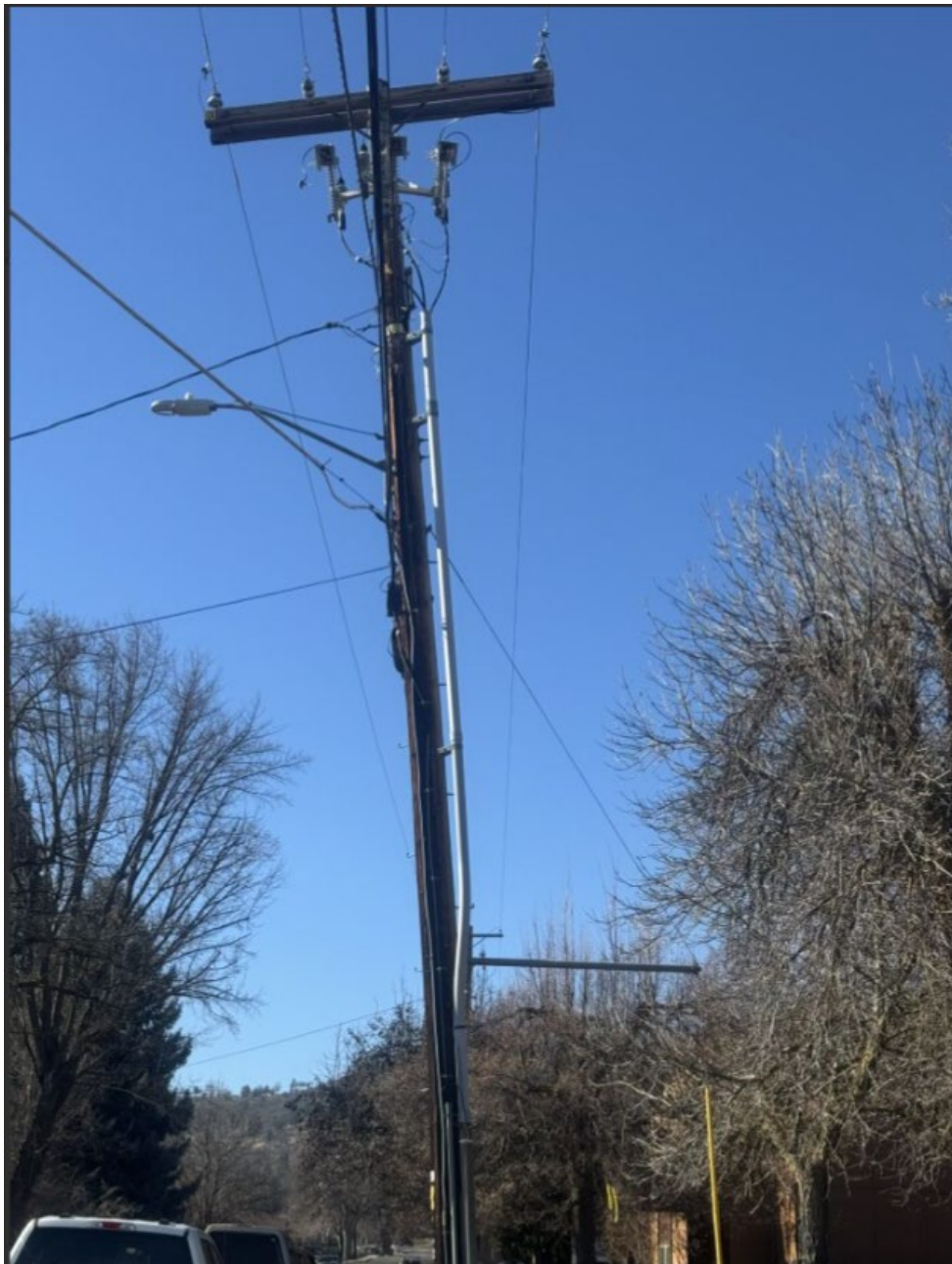
Picture 4: Near Pole ID 624507.272701, at Coordinates 41.7241174853914, -122.645554862033. Picture taken January 13, 2026.