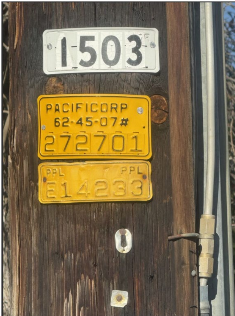
Picture 1: Near Pole ID 624507.272701, at Coordinates 41.7241174853914, -122.645554862033. Picture taken January 13, 2026.