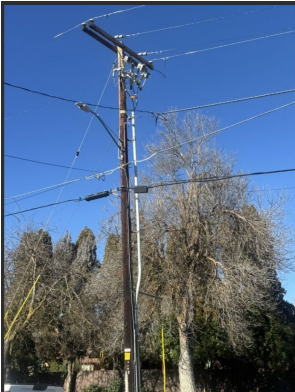
Picture 2: Near Pole ID 624507.272701, at Coordinates 41.7241174853914, -122.645554862033. Picture taken January 13, 2026.