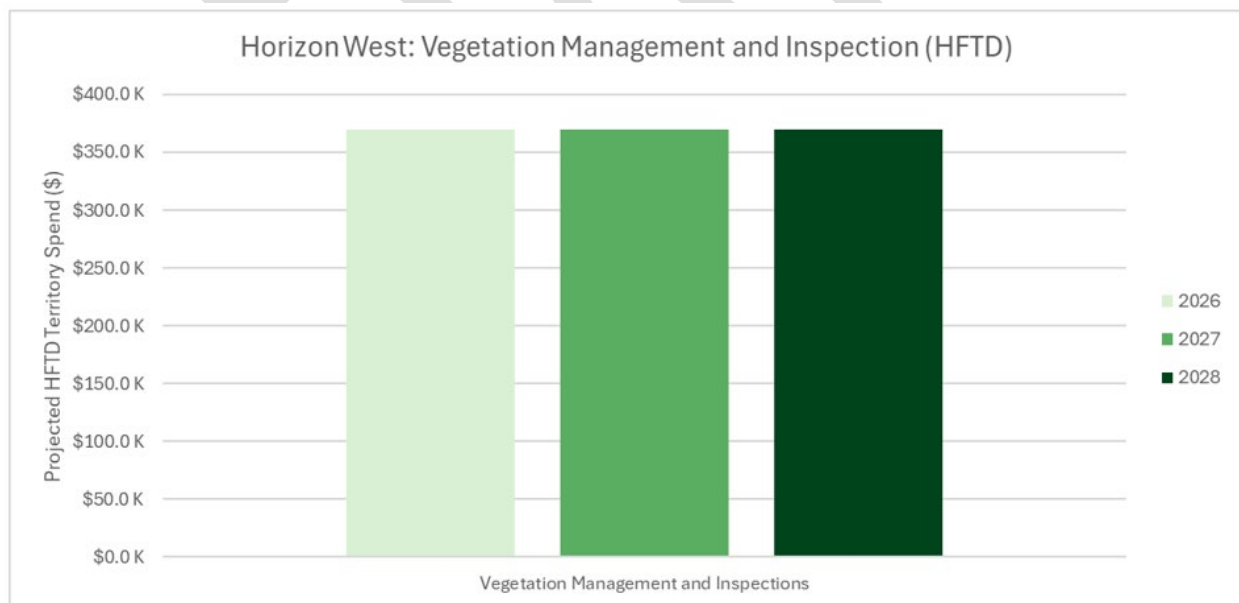
Figure 4-1. HWT Vegetation Management and Inspection in the HFTD by Year