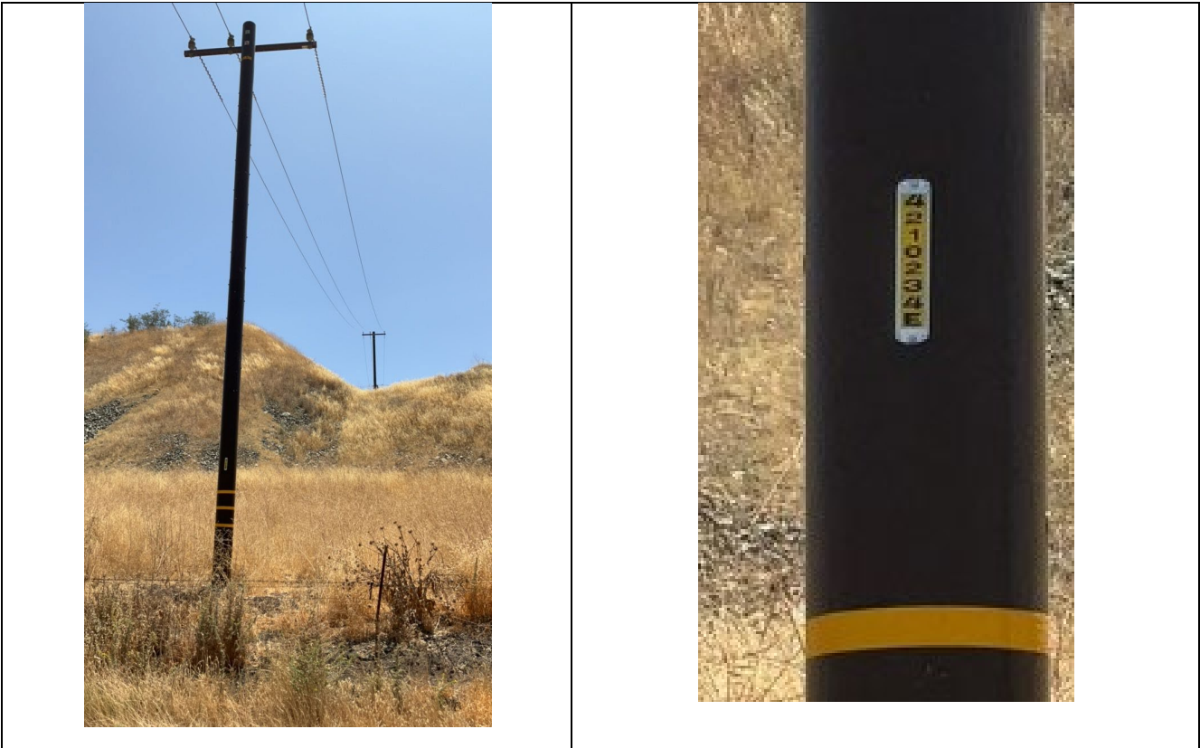
G1mg1: Overall Structure