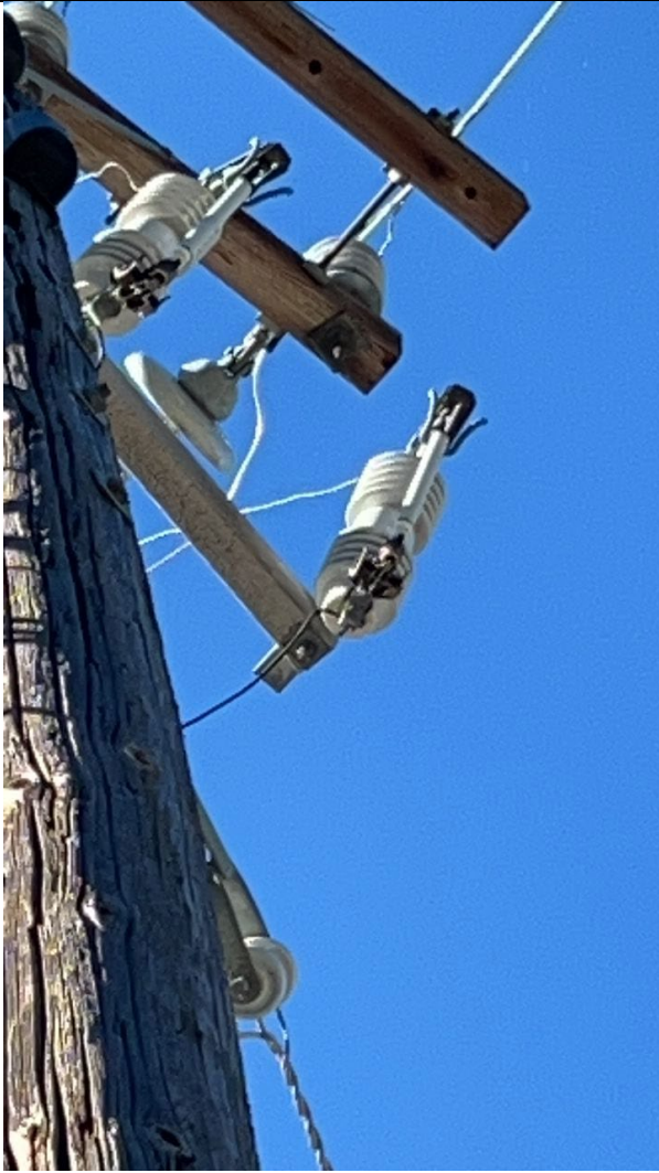
Item1IA1img1: Two of the three non-exempt expulsion fuses