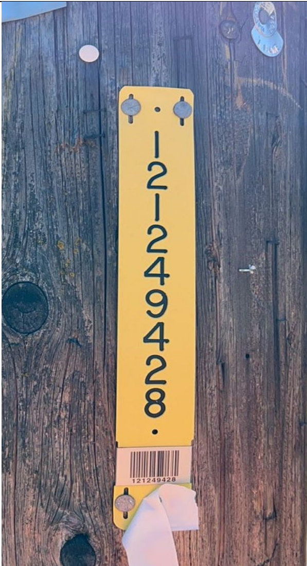
Item1G1mg2: Pole ID