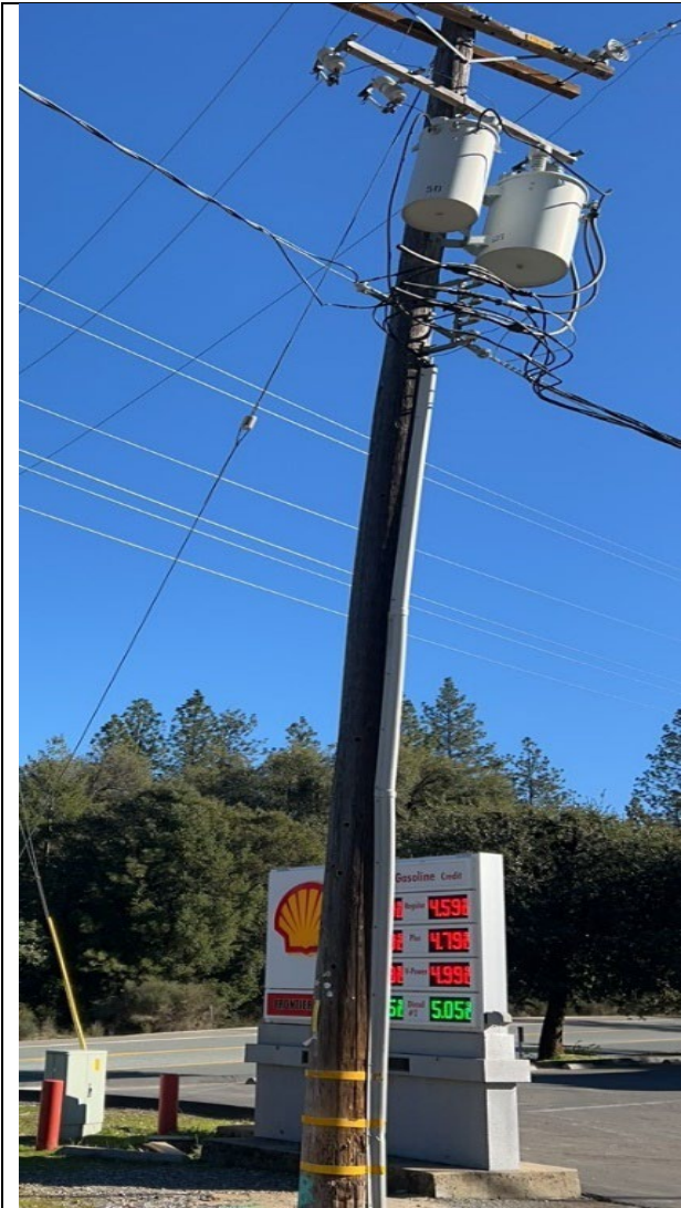
Item1G1mg1: Overall Pole