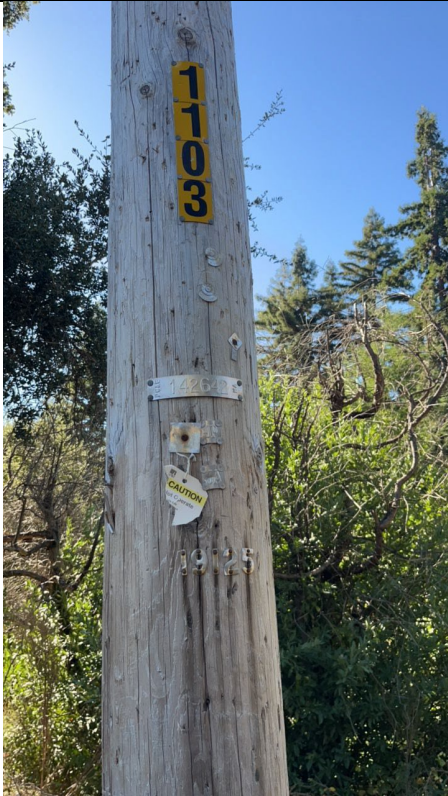
Item1Gimg2: Pole ID