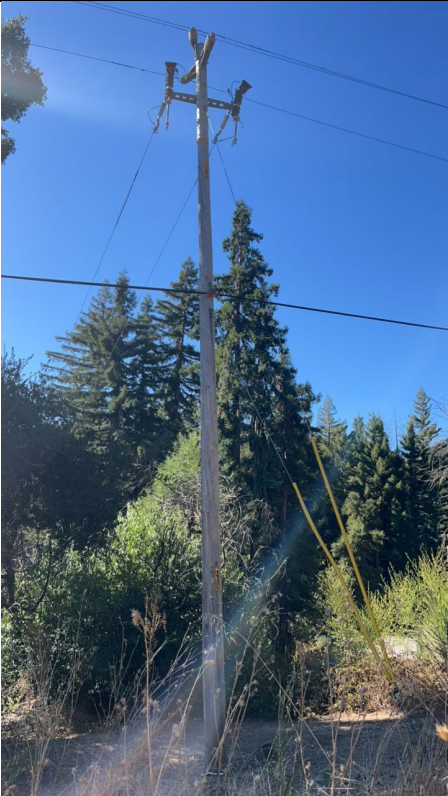
Item1Gimg1: Overall Pole