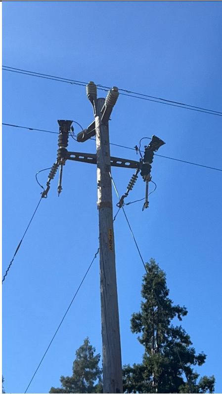
Item1GImg3: View of exempt fuses and Cutout Clamps