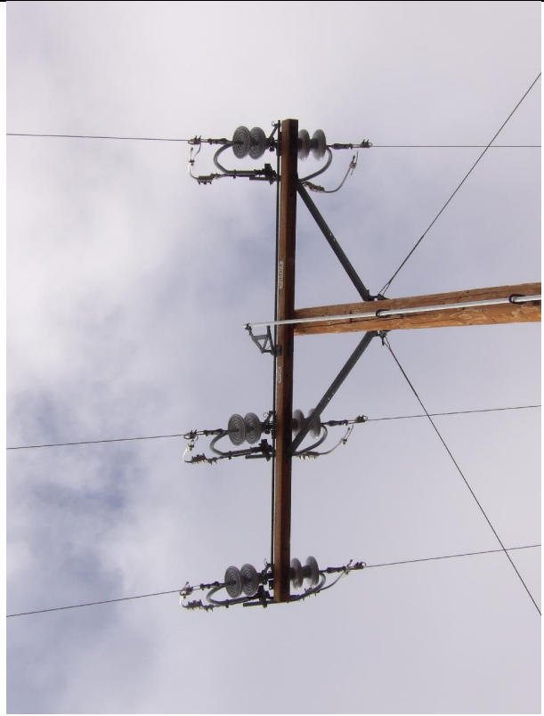
Item1IA1mg2: View showing no wildlife covers installed.