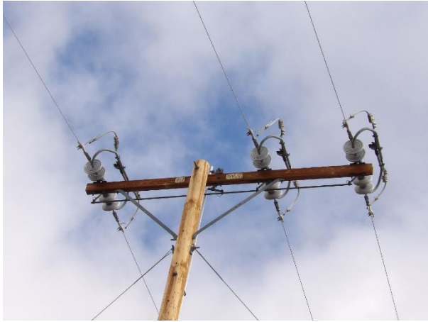
Item1IA1mg1: View showing no wildlife covers installed