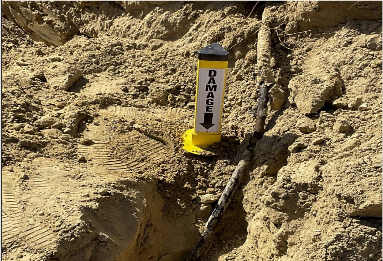
Photo 2: Photograph provided by San Diego Gas and Electric of the 3/4” steel pipe that was damaged by Sunny Builders Group Inc. (Exh. 1.)

Barak stated that on June 24, 2025, a natural gas facility at 210 Rosebay Drive, Encinitas, California 92024, Encinitas, CA 92024, was damaged during “jackhammer work digging for a retaining wall footing.” (Exhs. 4, 7.)