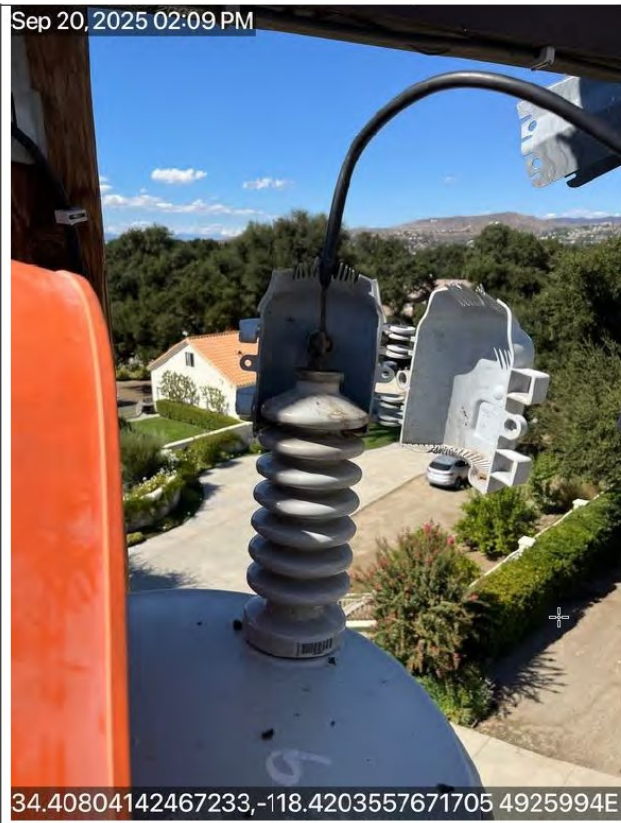
Photo 1 and 2: Completed Remediation, Structure 49925994E – September 20,2025