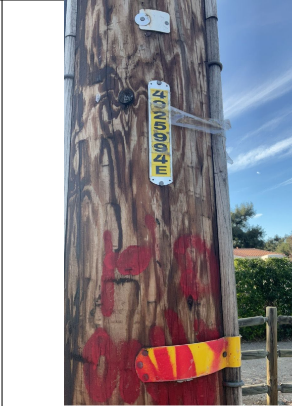
IA1Img2: Structure ID