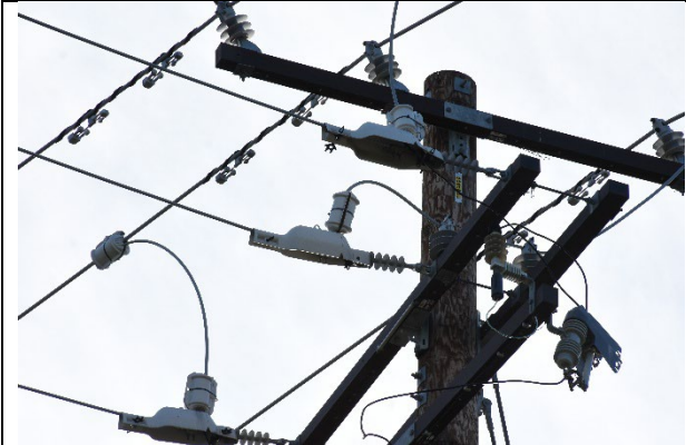
IA1Img3: Avian protection covers overview