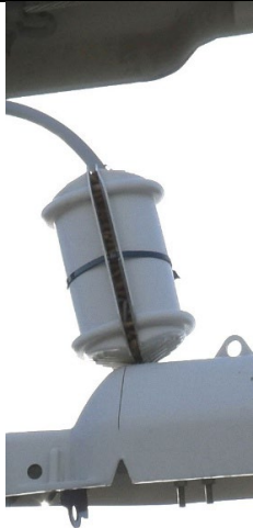
IA1Img4: View of acorns inside avian protection cover