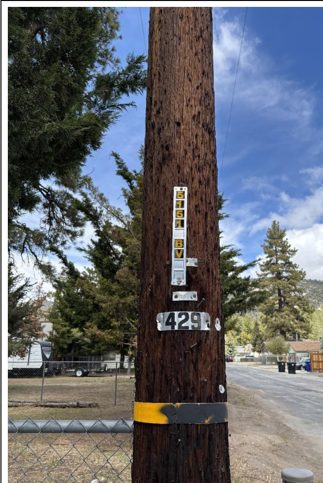
Photo 1: Photo of pole ID 5151BV, located 132 feet north of the subject tree.