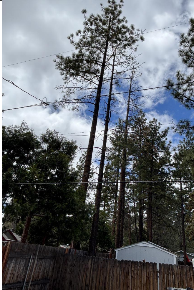
Photo 2: Photo of dead pine tree (right). Refer to NON_ESD_BVES_RGA_20260505_1247 regarding another dead pine tree shown on the left.