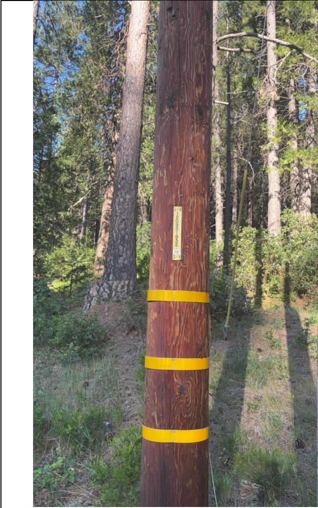
Photo 1: Photo of pole ID 120931932 located approximately 26 feet northeast of the subject tree.