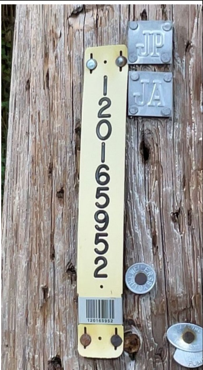
G1mg2: Structure ID.