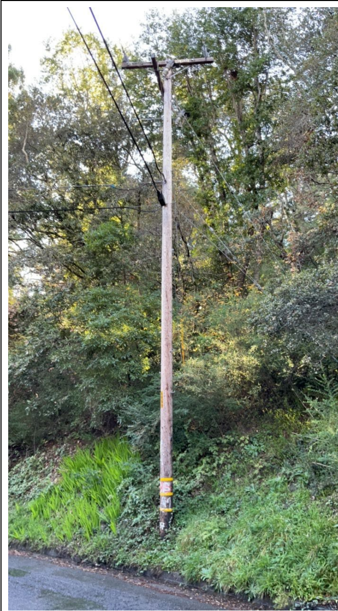
G1mg1: Overall Structure.