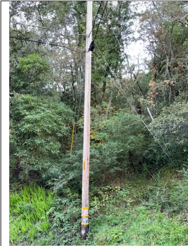
IA1Img1: Pole not cleared.