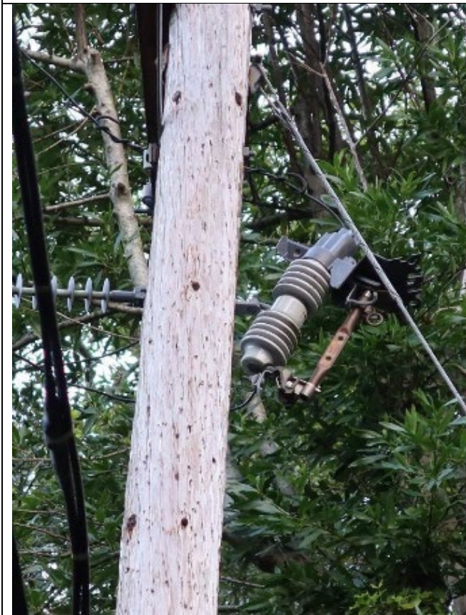
IA1Img3: Solid blade disconnect two.