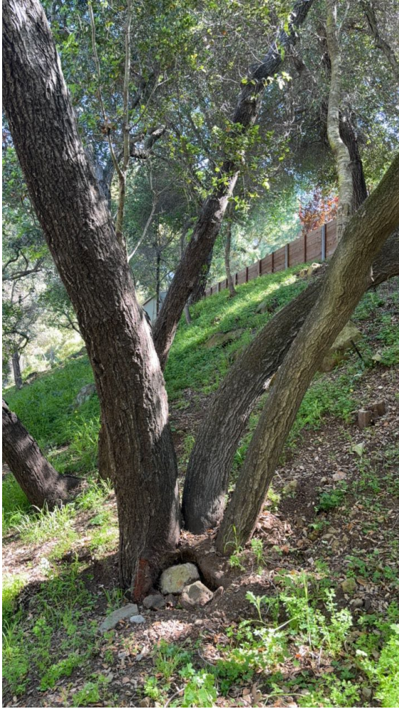
Photo 3: Photo of the three-stemmed trunk of oak tree. Photo taken west of the tree and pole, looking east.