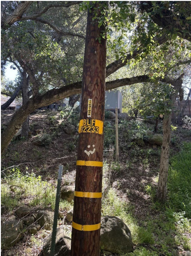
Photo 1: Photo of pole ID 1169162E located approximately 65 feet east of the subject tree.